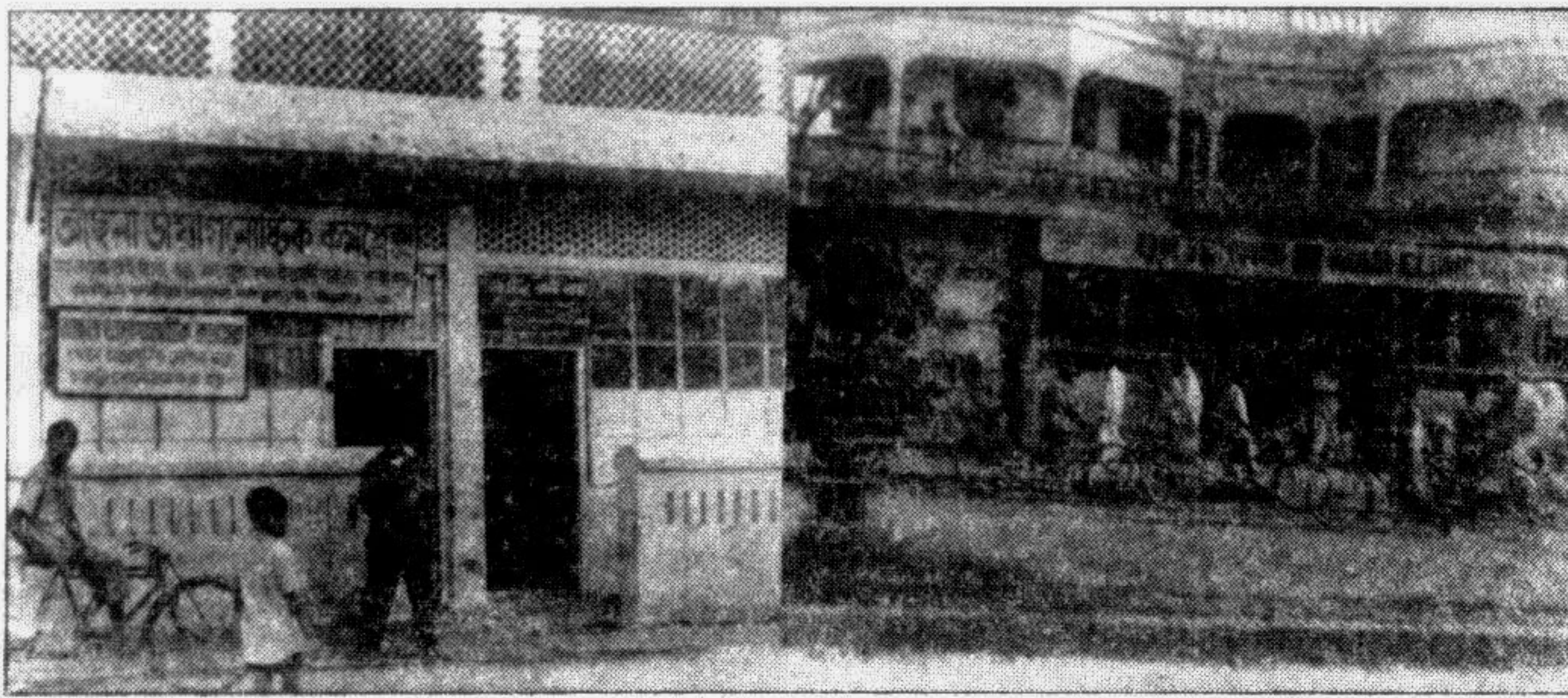
Two clinics in Narayanganj town having no registration continue to offer services.

NARAYANGANJ, Sept 23: Sixteen out of 26 clinics and pathological laboratories in Narayanganj town have been operating since long without having any registration. Only five clinics and pathological laboratories are registered, and the remaining five clinics were running unregistered for many years before they were closed, according to sources in the district Civil Surgeon office.