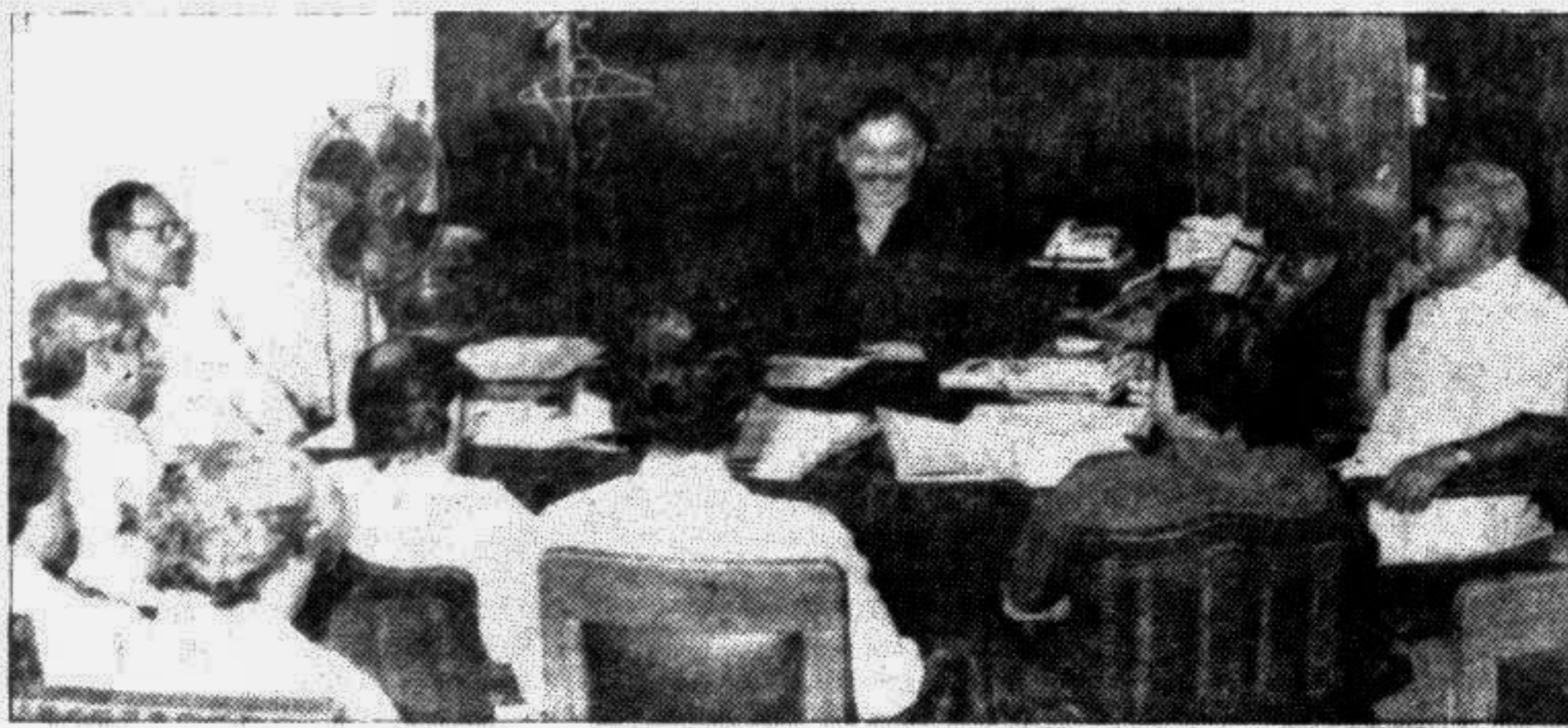
Labour and Manpower Minister Mir Shaukat Ali presiding over an inter-ministerial meeting on bringing back the Bangladeshis detained in different detention camps in Malaysia at his office in the city yesterday.

Every time during hartal there will always be a certain crowd (mainly students) which is ecstatic at the idea of it, while for another group it's merely another day of drudgery, under unfriendly, anti-social circumstances.