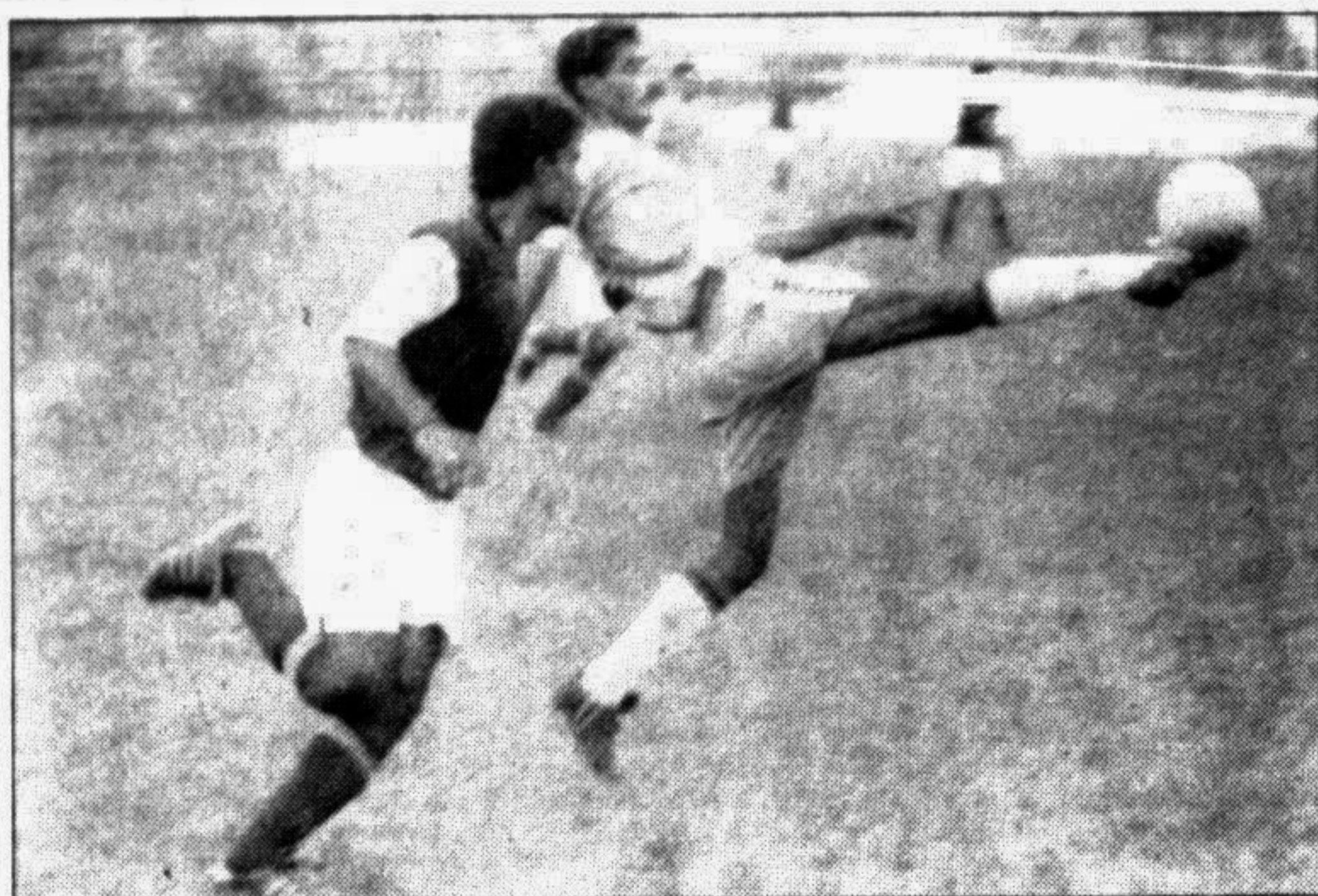
Action from yesterday's Lifebuoy First Division football league match between Bangladesh Boys and Sadharan Bima at the Dhaka Stadium. Boys won 1-0.