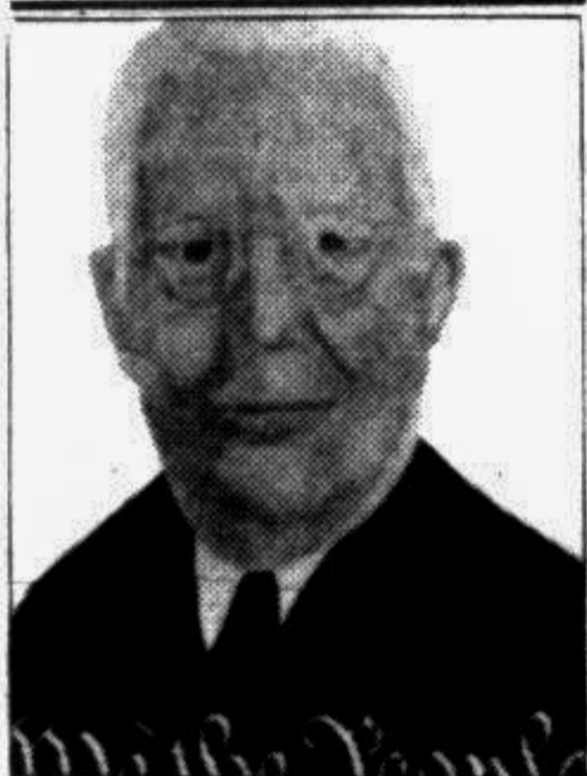
Earl Warren (US Chief Justice)

The sports page records people's accomplishment. The front page usually records nothing but man's failures.