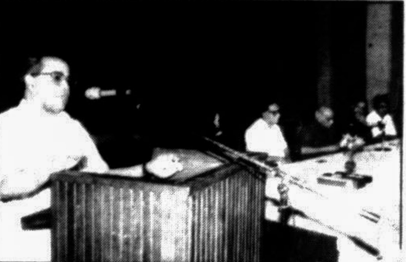
Dr K M Nazrul Islam speaking at a discussion on cancer jointly organised by health and sanitation wing of BUET and Bangladesh Cancer Society at BUET auditorium on Wednesday.

TO LET A newly built modern house for rent at Road 16, Plot 16, Sector 3, Uttara. Three floors, seven bed rooms, attached baths and spacious drawing/dining and fitted kitchen. Suitable for foreigners. Please contact at site or Phone at 801156/811655. S-463