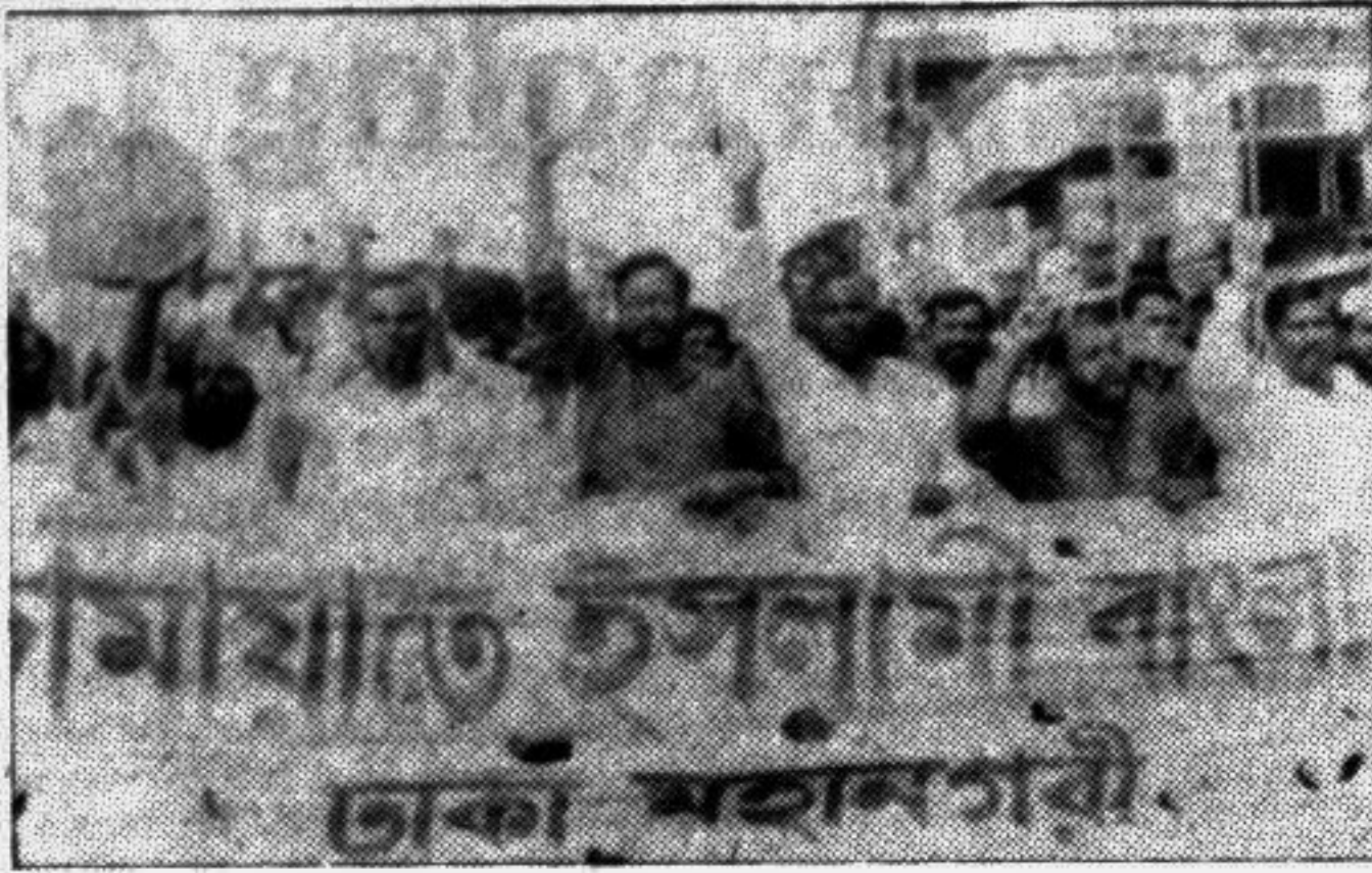
The city unit of the Jamaat-e-Islami brought out a procession in the city yesterday in connection with the opposition's 72-hour marathon hartal.

The part-time job seekers in a spirit of enterprise and challenge, stride forward with determination to try to find out new openings to augment their income through honest means.