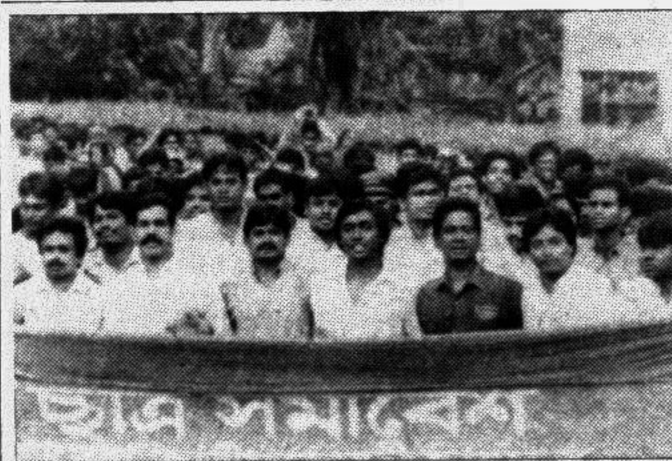
The Jatiyatabadi Chhatra Dal (JCD) yesterday brought out a procession on the Dhaka University campus condemning the incident of humiliation of an elderly government official by pro-hartal pickets on the campus Saturday.

Chalachitra Film Society: 'Entr'acte' by Rene Clair will be screened as part of the 'Avant-Garde and Surrealist Cinema Festival'. Venue: Alliance Francaise de Dhaka. Time: 5:30 pm.