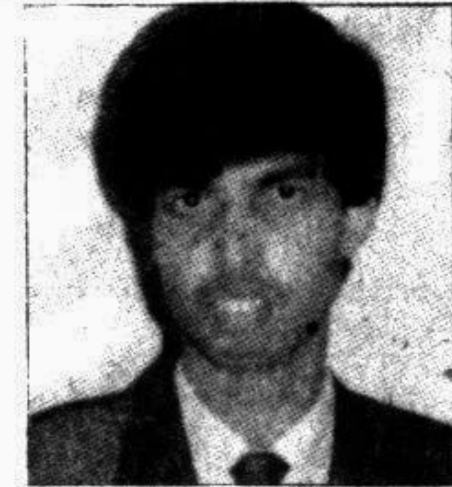
Masud's photo show begins tomorrow

The meeting demanded formulation of education policy on the basis of Dr Qudrat-i-Khuda Education commission report, Interim Education Policy of 1978 and the ten recommendations by the sub-committee of the education ministry in conformity with the modern technology.