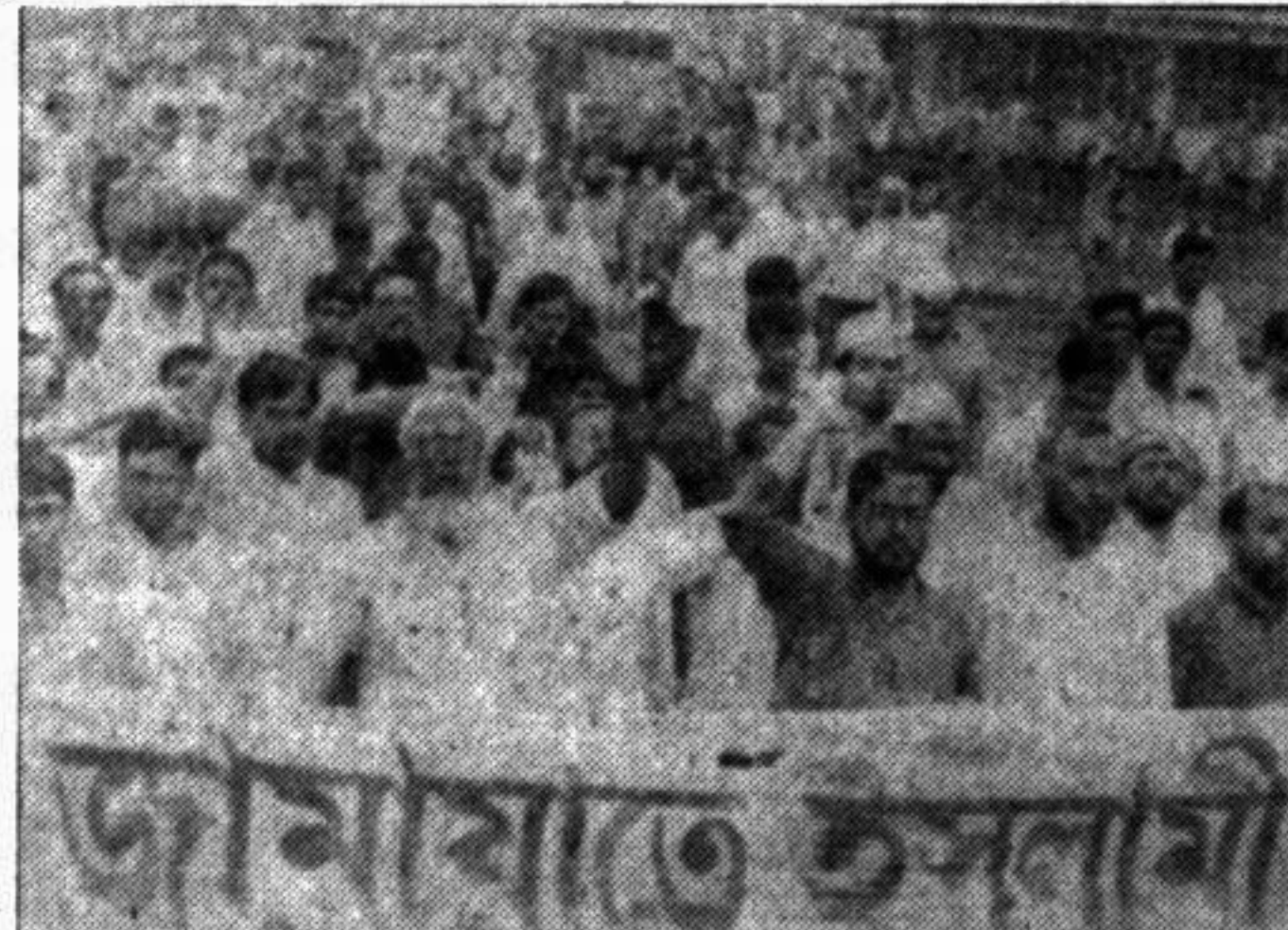
The city unit of Jamaat-e-Islami Bangladesh brought out a procession in the city yesterday in support of opposition's 72-hour nation-wide hartal.