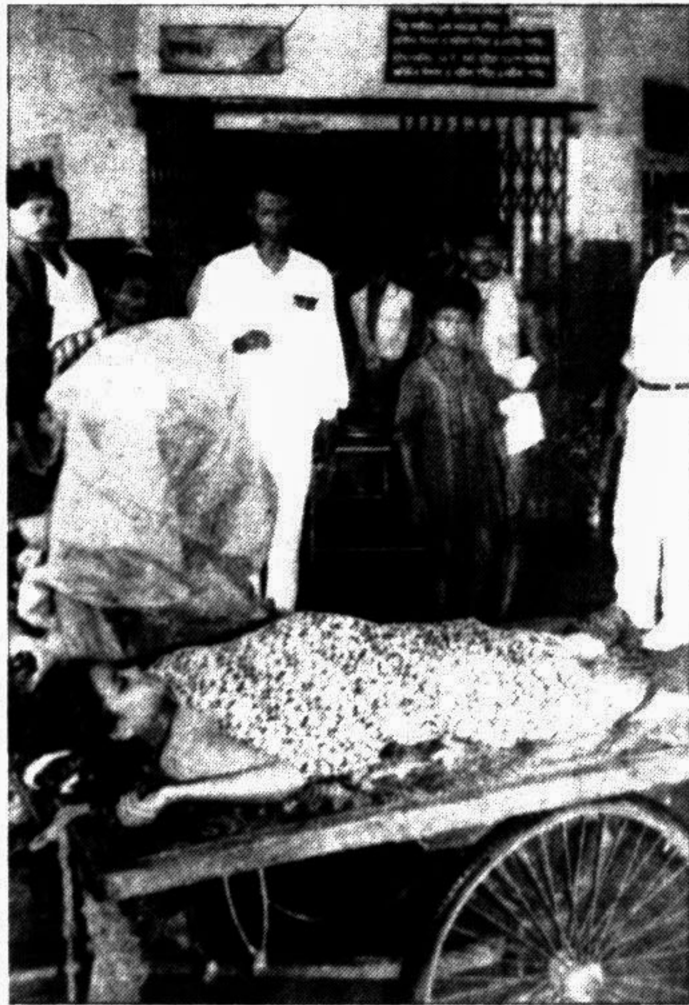
A pregnant woman was carried to the Dhaka Medical College Hospital from Demra area of the city by a rickshaw yesterday.

By Staff Correspondent Different organisations yesterday strongly condemned the incident of stripping a government official of his clothes by pro-hartal pickets Saturday morning in the city. In separate statements, leaders of these organisations said that the act was 'unfortunate' and abuse of human rights. Human respect and dignity must be maintained in public life. See Page 12 Col 3