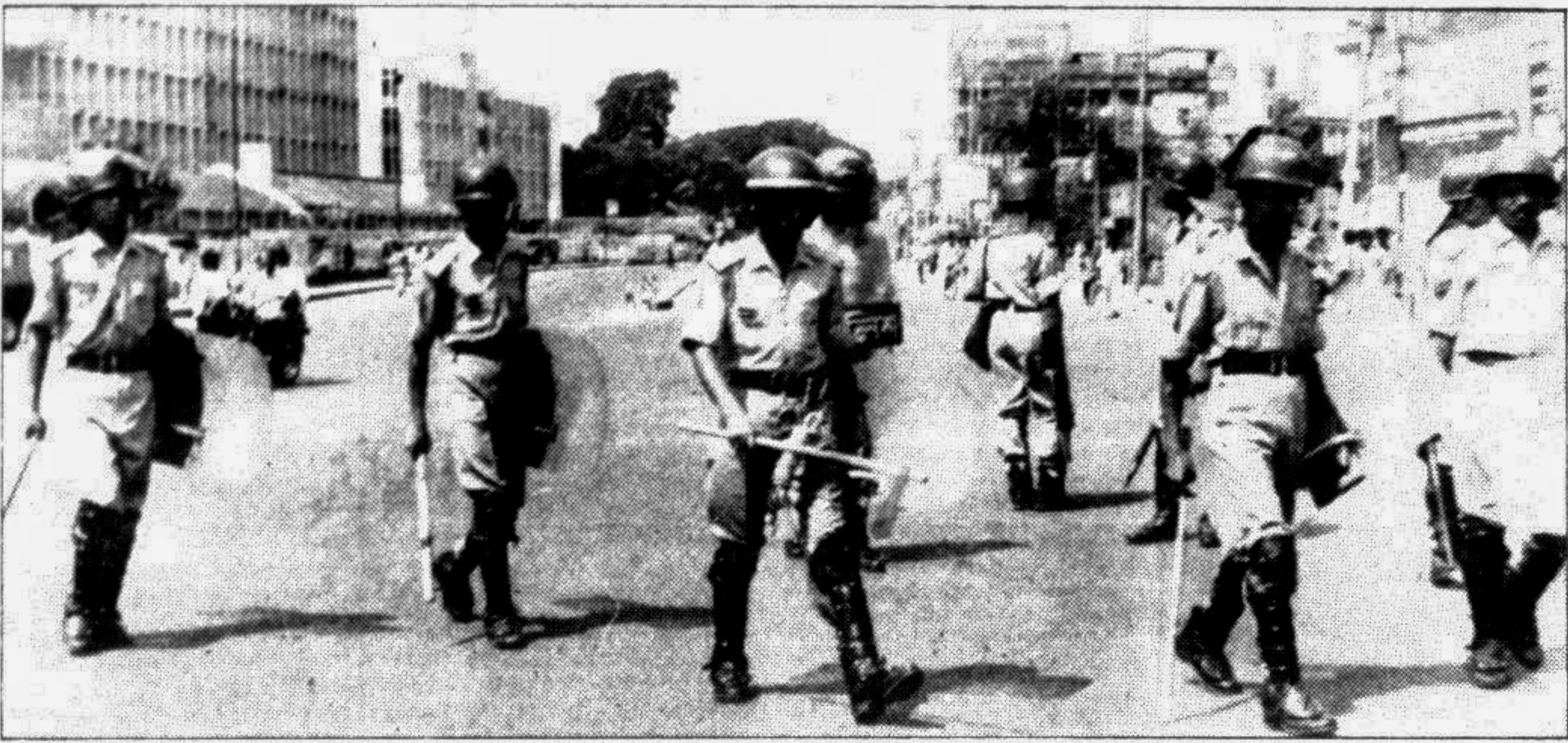
Police patrol the streets near Purana Paltan intersection in the city during the hartal hours yesterday.