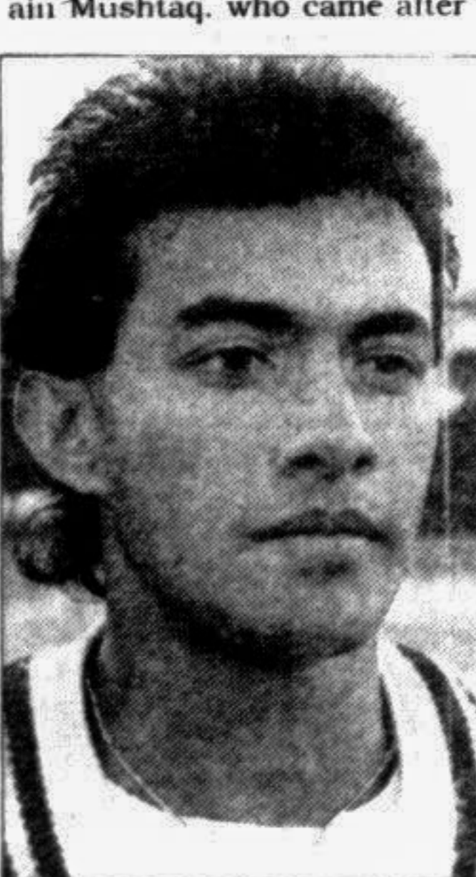
TILLEKERATNE ... 115

Bowling: O M R W Wickremasinghe 6 121 0 Vaas 6 29 0 Gurusinha 1 0 5 0 De Silva 3 0 7 0 Muralidharan 2 2 0 1