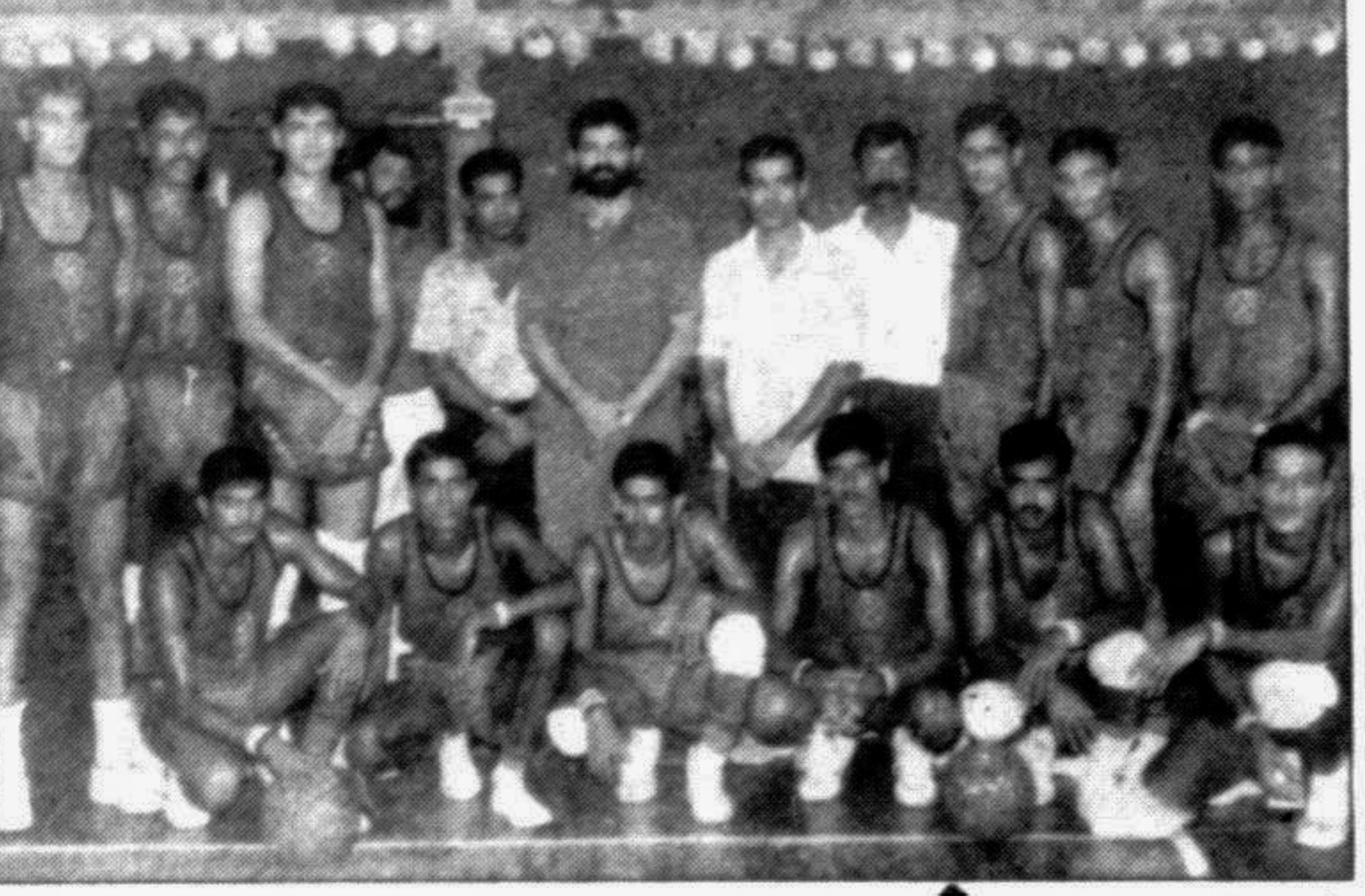
The Bangladesh Army basketball team which picked up the Pepsi 18th national title defeating holders Bangladesh Navy 80-76 after extra-time at the Dhanmondi Gymnasium yesterday.