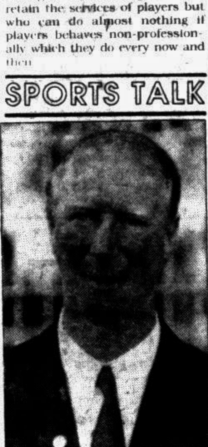
Jack Charlton (England soccer player, 1965)

The only thing that put me on the right path was the realisation that I could now earn big money and I liked that idea.