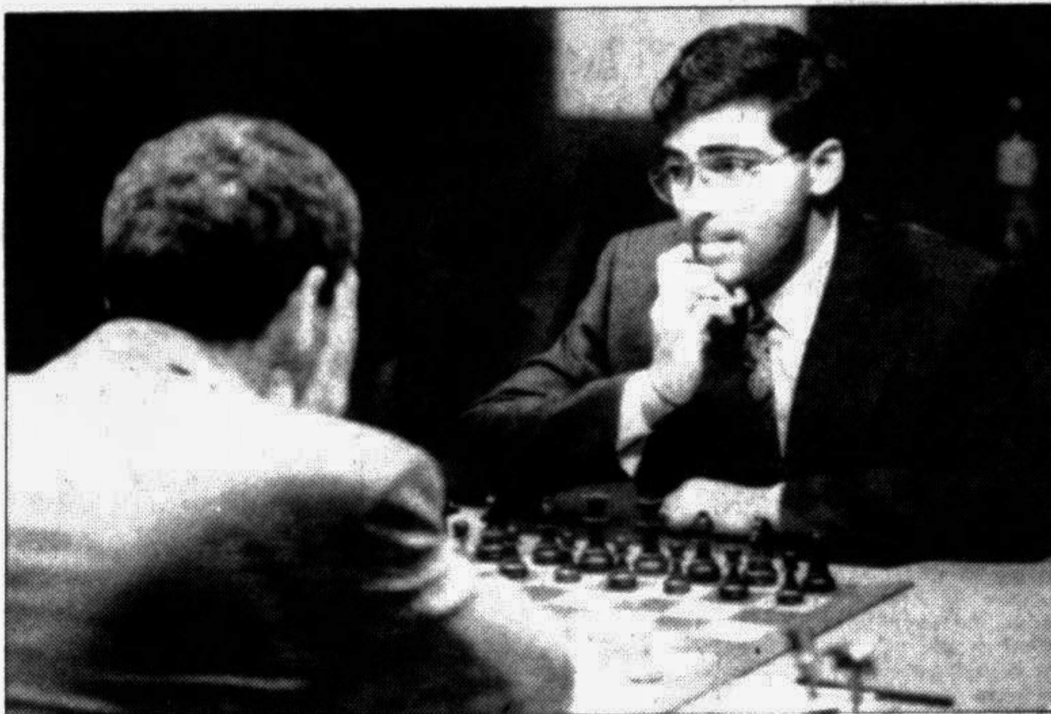
Viswanathan Anand of India thinks over his next move in the second game of the World Chess Championship against holder Garri Kasparov in New York on Sept 12. The game was drawn

In other games, Yugoslavia scored their victory by beating Latvia 3-0 (17-15, 15-9, 15-4). Greece also won their third game by defeating Ukraine 3-0 (15-5, 15-12, 15-9). Poland scored their first victory in the competition by beating Romania 3-0 (15-13, 15-3, 15-5).