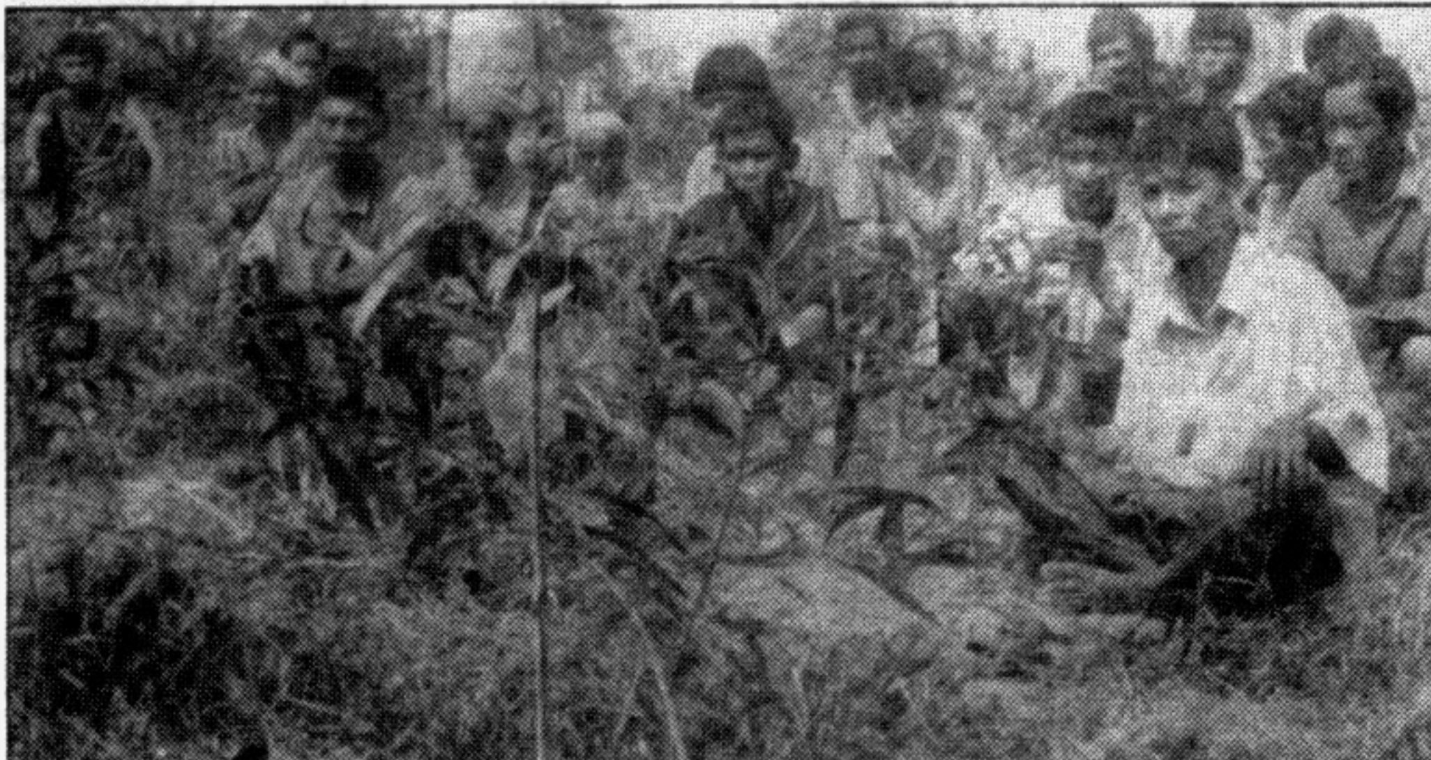
A weed removing team consisting of tribal labourers relaxing in a forest.