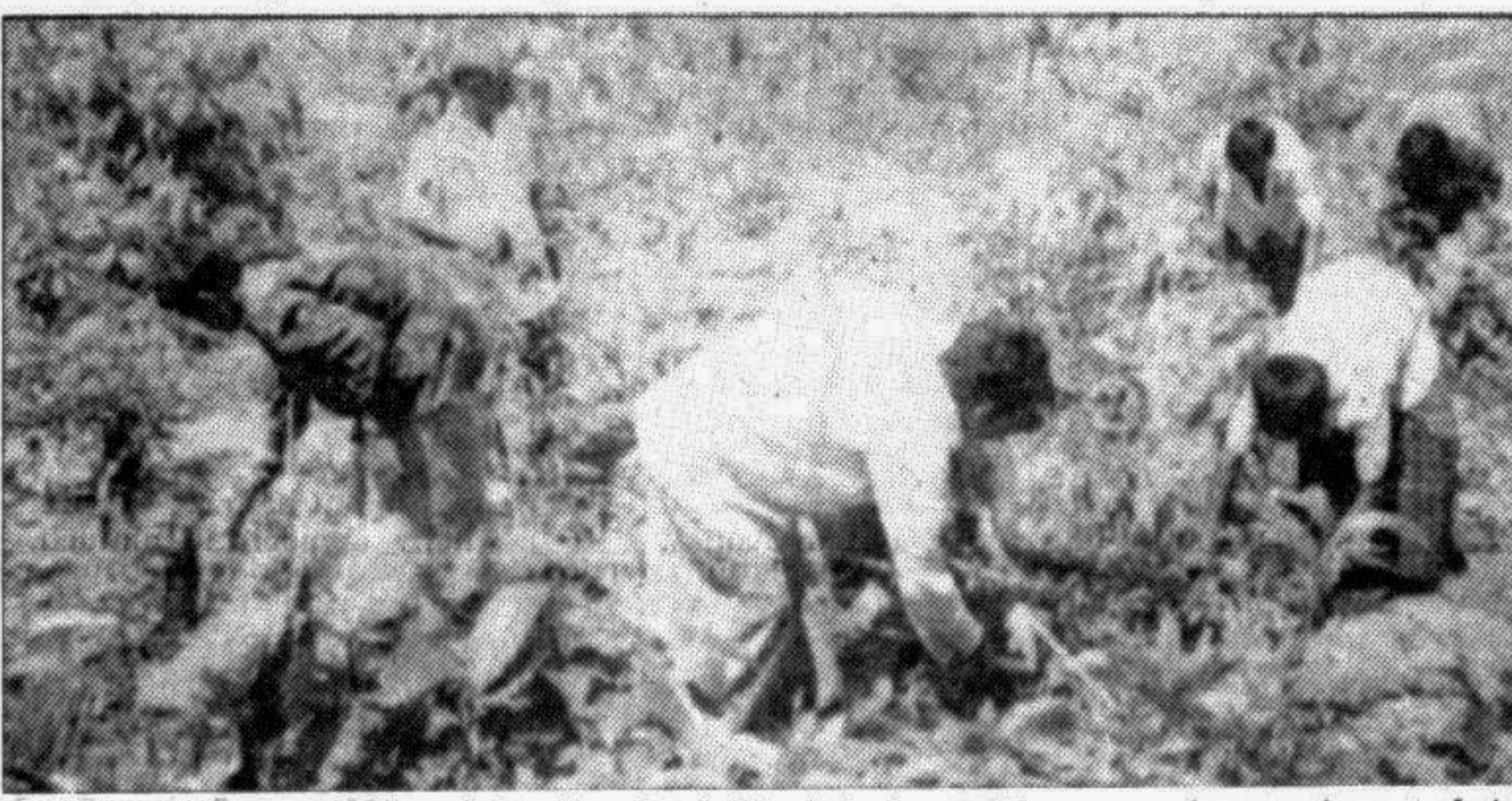
Divisional Forest Officer (standing far behind) is inspecting a weed removing work in Kuyachhari newly planted pulpwood reserve forest.