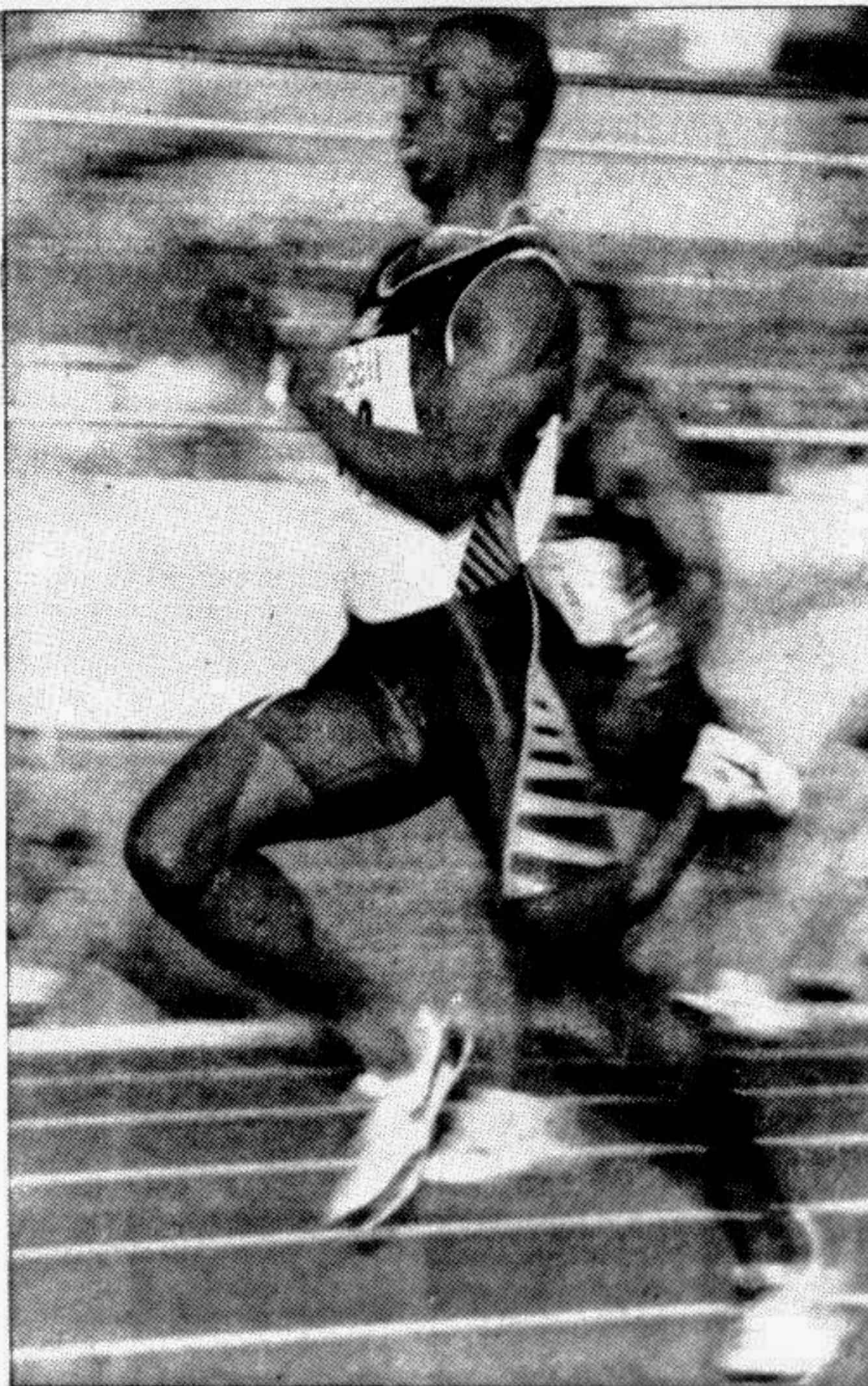
World record holder Michael Johnson of the US on way to winning the 200m gold at the IAAF Athletics Grand Prix in Monaco on Saturday. The American sprinter supreme clocked 19.93 sec.

Our regular item 'crossword' could not be accommodated due to unavoidable reason. Inconvenience to our valued readers is regretted. — Sports Editor