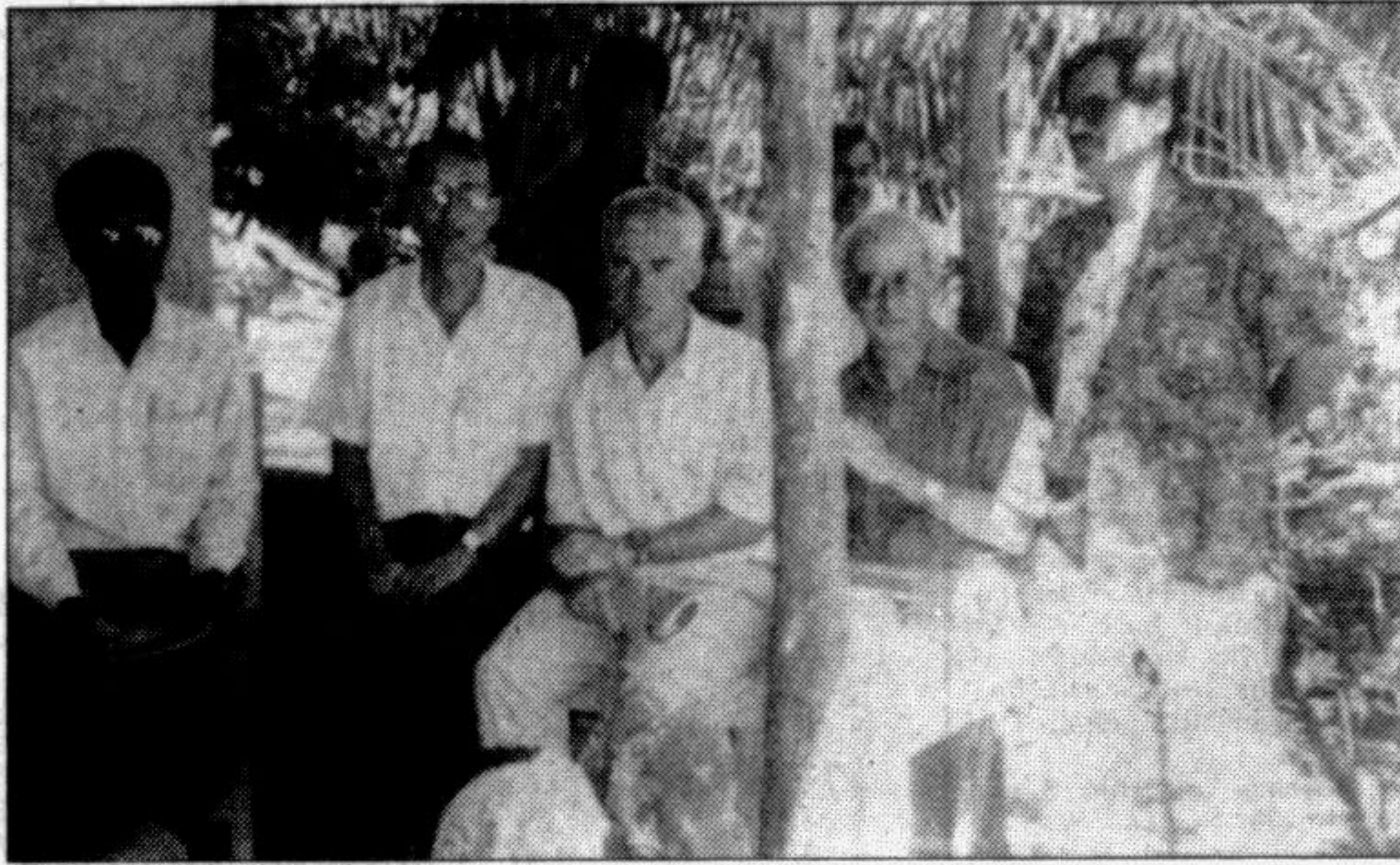
British officials visited ASA's Rajendrapur unit office in Gazipur district recently.

Jordan's King Hussein, who withdrew his support for Iraqi President Saddam Hussein in televised speech last month, said he did not want to close the border with neighbouring Iraq.