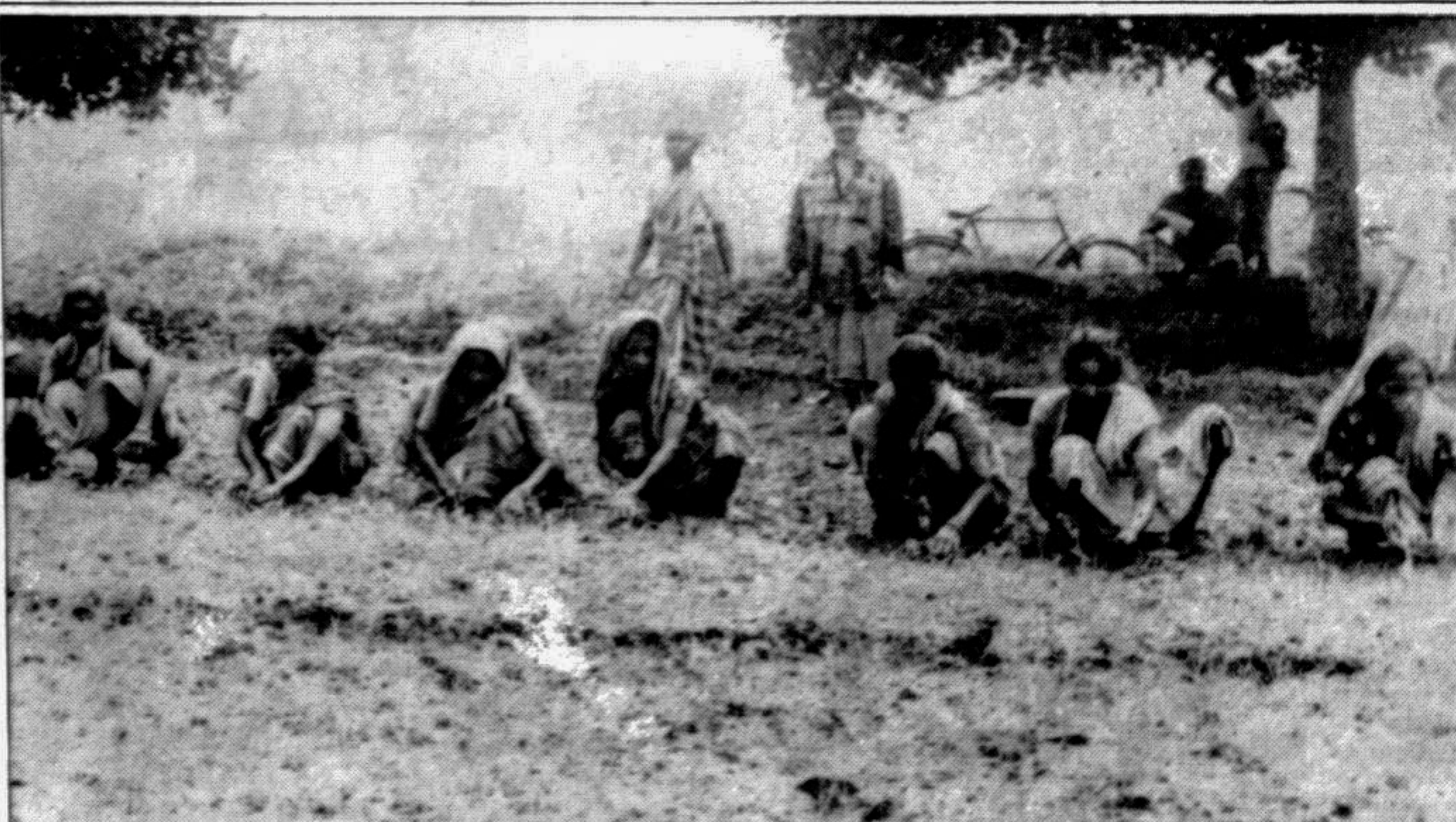
Women labourers toiling on the Nashipur Jute Seed Farm, ten miles from Dinajpur town, run by the Bangladesh Agriculture Development Corporation. The labourers receive Tk 38 only for a staggering 8 hours of labour.

KUSHITIA, Sept 9: Female students of 34 schools and 3 madrasahs have been provided with scholarship to the tune of Taka 14 lakh under Female Secondary School Assistant Project introduced by the government for developing female education in the country. About 5000 female students were benefited by this scholarship from January to June of the current year. Besides five lakh taka have been sanctioned as tuition fees in these schools.