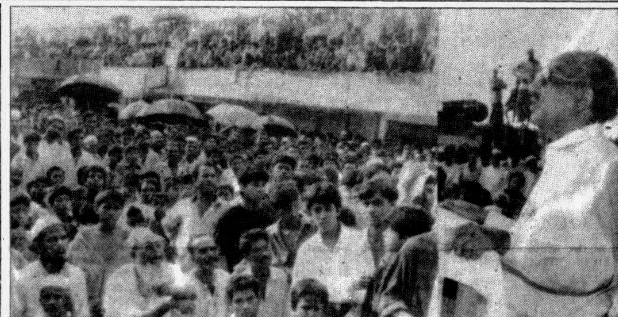
SYLHET: Finance Minister M Saifur Rahman addressing a public meeting at Gobindaganj bazar under the auspices of Chhatak thana Jubadal recently.