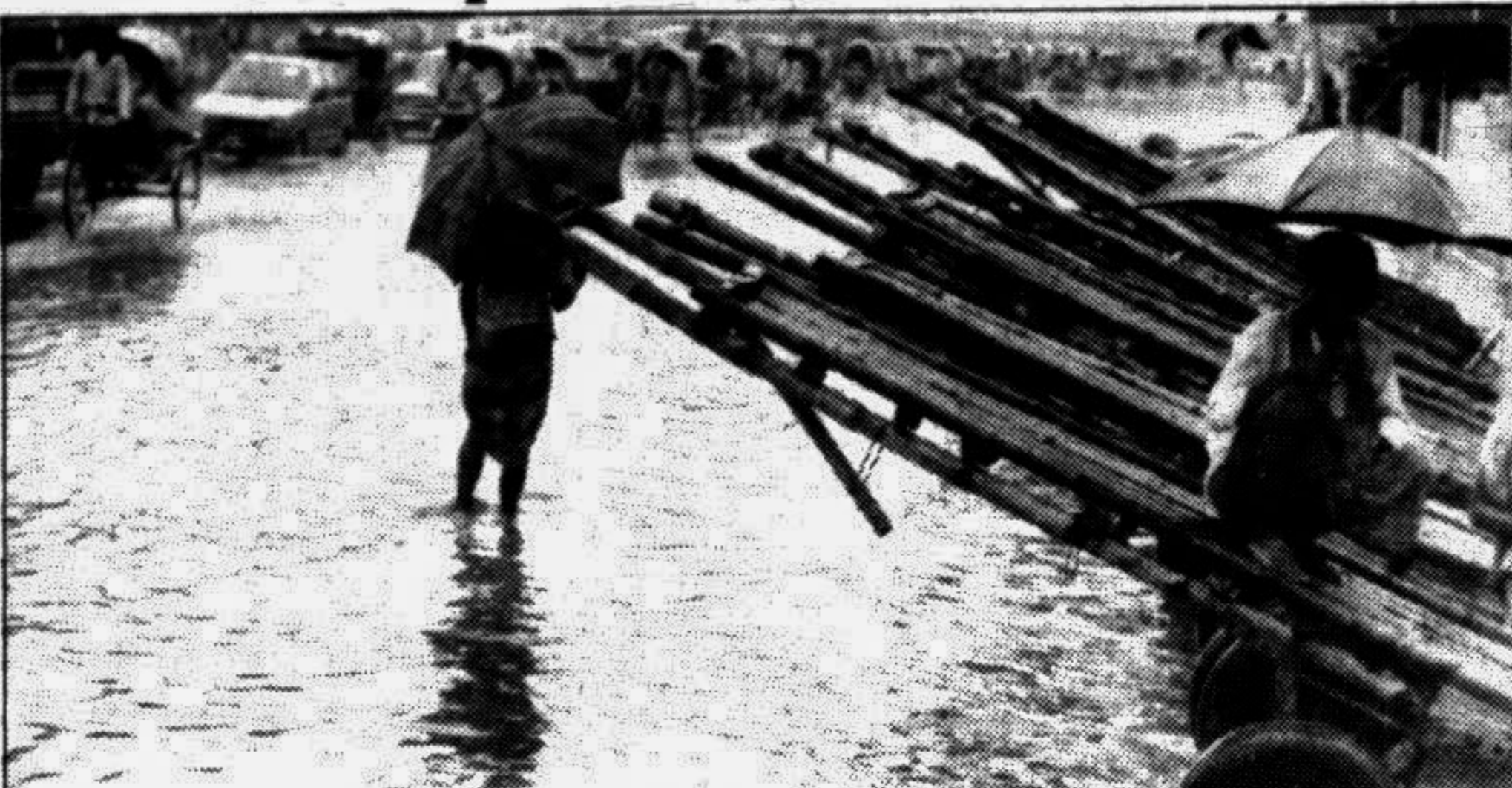
A brief but heavy downpour came as a welcome relief yesterday amidst scorching heat of past few days. And without exception it rendered city's Kakrail area submerged.