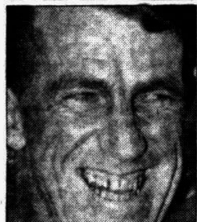
Sir Edmund Hillary (Famous explorer from New Zealand)

"Because my name appears in history books, most children think I am dead."