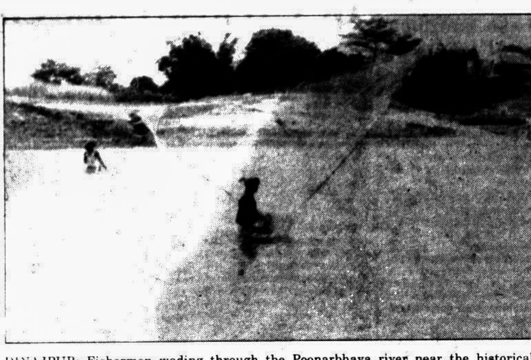
DINAJPUR: Fishermen wading through the Poonarbava river near the historical Kuntanagar Temple, about 30 km from Dinajpur town. Many rivers experience similar condition like Karatoa in Bogra, Choto Jamuna, Atrai in Naogaon, Baronai in Rajshahi. Beside this major river like Padma over the years has seen development of numerous shoals.

From Staff Correspondent, CHITTAGONG, Sept 8: Some two hundred students of Chittagong University demonstrated at the Chittagong railway station. In protest against suspension of the shuttle train service. Police said the shuttle service from the city was suspended after a local train's engine fell down near Sholashahar.