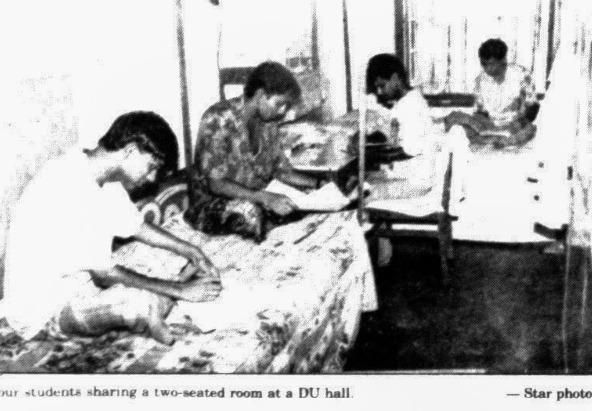
Four students sharing a two-seated room at a DU hall.

By M M Aminul Islam Students coming from different parts of the country to study in the Dhaka University are facing acute accommodation problem in the residential halls. According to the available statistics, about 60 per cent of the nearly 29,000 students of the DU come from different districts. The university has fifteen residential halls — eleven for male students, three for female students and one for foreign students. The total number of seats in the residential halls, excluding that for foreign students, is about 8,000 but about 12,000 students are staying there. Only six halls were built after independence. The number of seats in Jagannath Hall is 1,105, Shahidullah Hall—813, Zabu See Page 12 Col 8