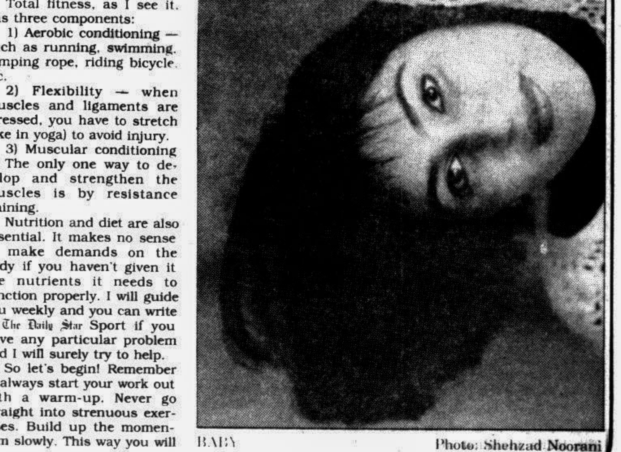
BABY L ETS face it, ladies. When it comes to working out, its time to forget about everything else and get serious about your "one and only body".

SIDE BENDS This movement stretches Stand upright, feet wide apart. Raise your right hand overhead and keep the left hanging on the side. As you bend side ways, keeping the arm close to the head and straight, feel the stretch on the side of your body. Tighten your buttocks and curl your pelvic up more. Breathe normally.