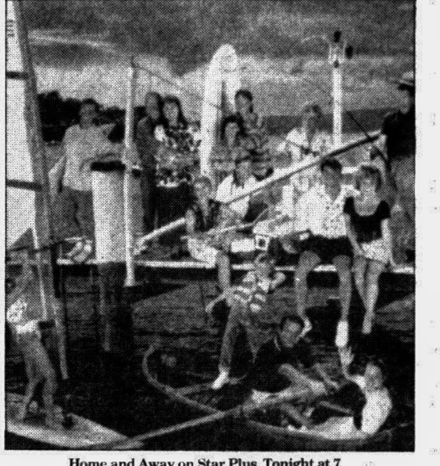
Home and Away on Star Plus, Tonight at 7