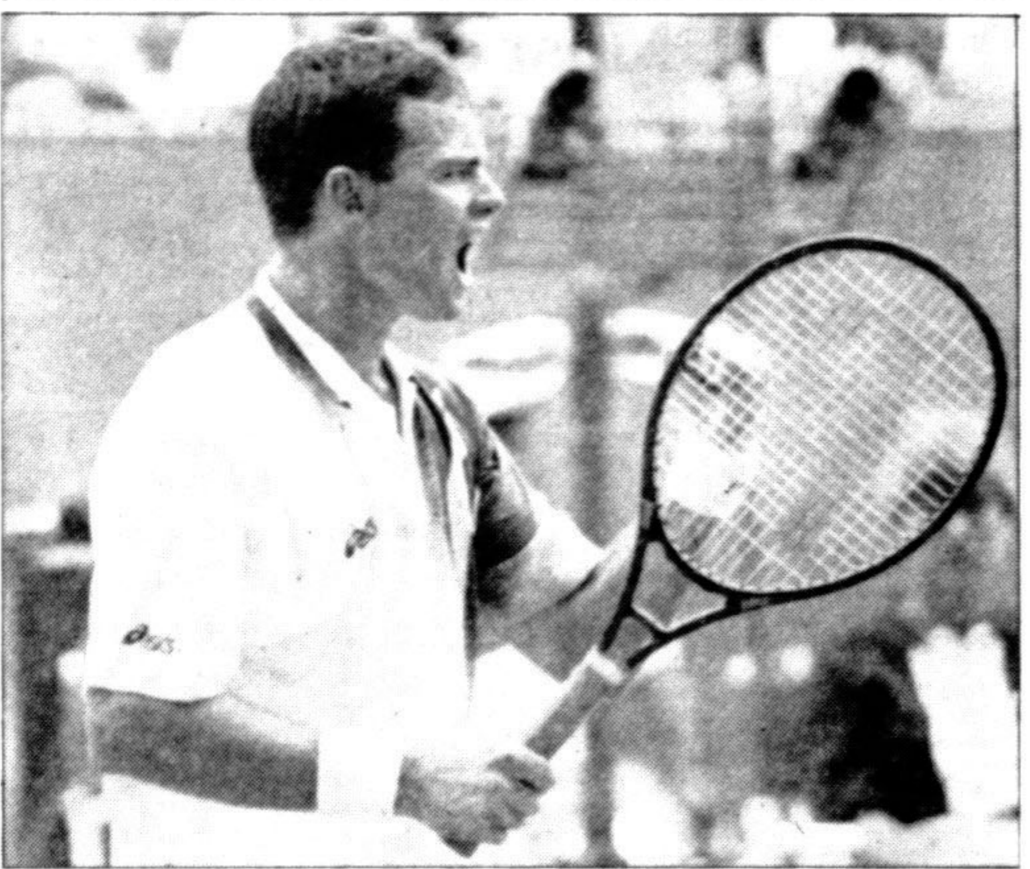
Byron Black, the new sensation from Zimbabwe, shows his ecstasy after sending eighth-seeded German Michael Stich packing in the third round of the US Open at Flushing Meadows, New York, on Sept 5. Black came through the tense five setter 6-4, 6-4, 3-6, 2-6, 6-3.

Fourth summer athletics: Venue: Mirpur Stadium (starts at 10 am)