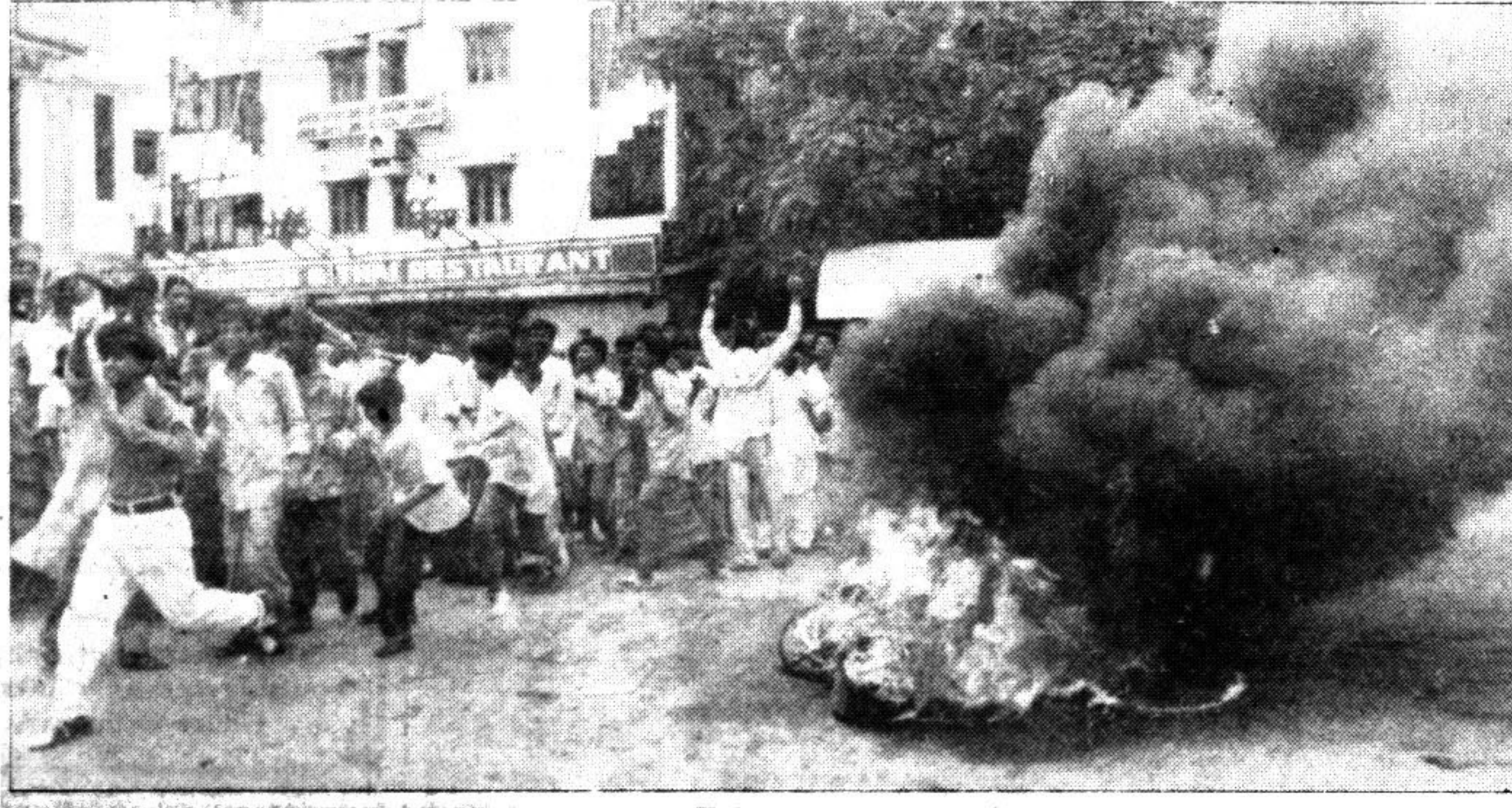
Pickets burned tyres at Mirpur road near the Sobhanbagh area during hartal hours yesterday.

From Staff Correspondent TEKNAF, Sept 6: The Myanmar trade delegation left here for Yangon this afternoon after an overnight stay at Cox's Bazar following the signing of the Bangladesh-Myanmar border trade agreement yesterday.