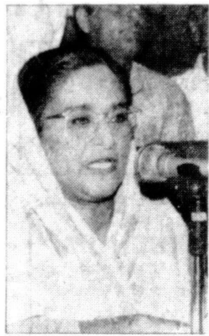
Hasina addressing newsmen yesterday.

By Staff Correspondent Awami League chief Sheikh Hasina has proposed formation of an interim government headed by the Chief Justice for holding the next general elections and demanded immediate dissolution of the present Parliament. "Right now, this is our demand. I want exactly a '91 like interim government, to be headed by the Chief Justice, who will be assisted by an advisory council," said Hasina at a post-hartal press conference yesterday evening at the Jatiya Press Club. Other than holding the general elections, the caretaker government would only discharge the emergency and routine functions, the AL president added. In her 35-minute address at the press conference, the former leader of the opposition in Parliament said, "We will be able to give legality to this interim government in the very first session of the next elected Parliament as we did in case of the Shahabuddin government." "Time is running out. Let good sense prevail on the party in power. I hope we will need to call no more hartal for realising the peoples' demand," said Hasina, announcing her party's next course of actions that include a 72-hour countrywide hartal from September 16. Replying to a volley of questions, she said: See Page 12 Col 1