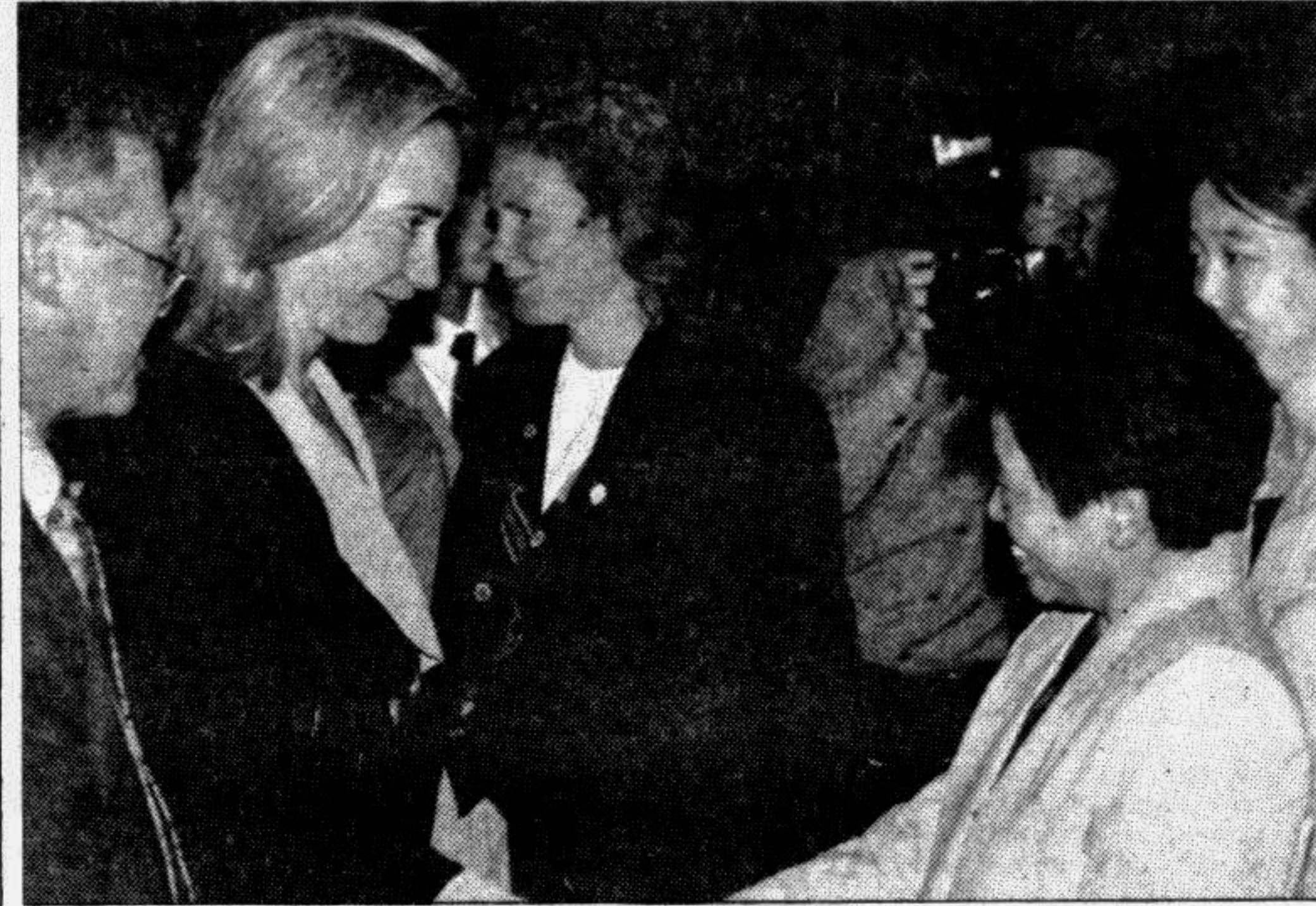
US First Lady Hillary Clinton (L) is greeted by an unidentified Chinese woman official upon her arrival yesterday at the old Beijing airport to attend the Fourth World Conference on Women.

Bangladesh economist and Grameen Bank managing director Dr Muhammad Yunus will speak tomorrow at a panel discussion titled "Banking on the Poor: Women's economic empowerment" which will be chaired by US First Lady Hillary Rodham Clinton.