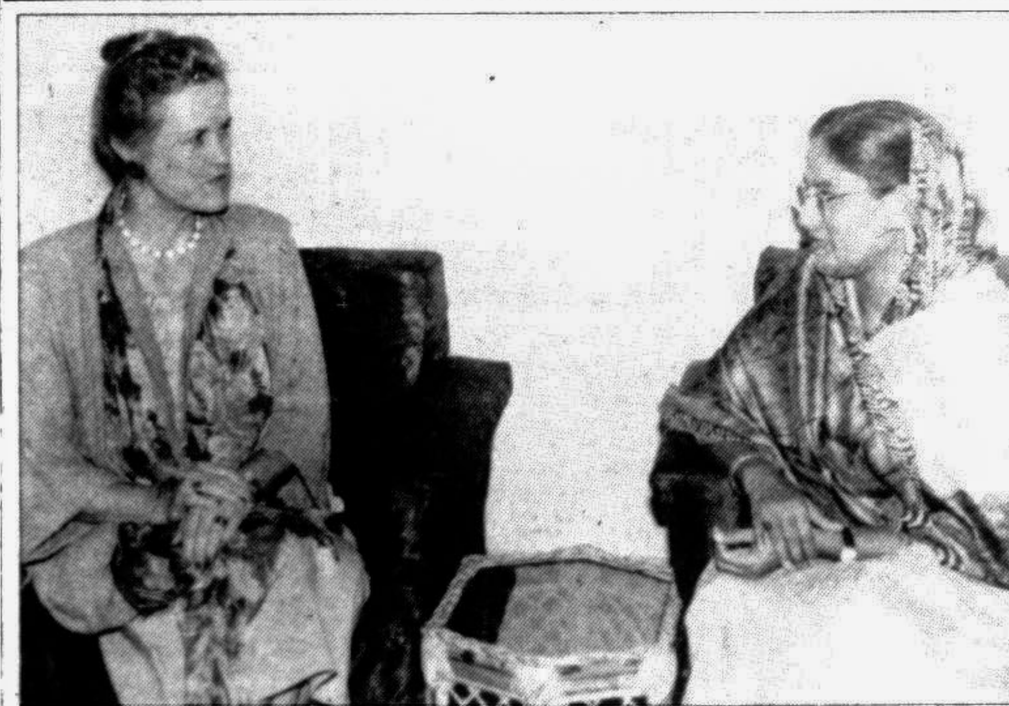
Visiting US Assistant Secretary of State Robin Lynn Raphel called on Awami League president Sheikh Hasina at her Dhanmondi office yesterday.

Minister for Fisheries and Livestock Abdullah Al Noman, See Page 12 Col 8