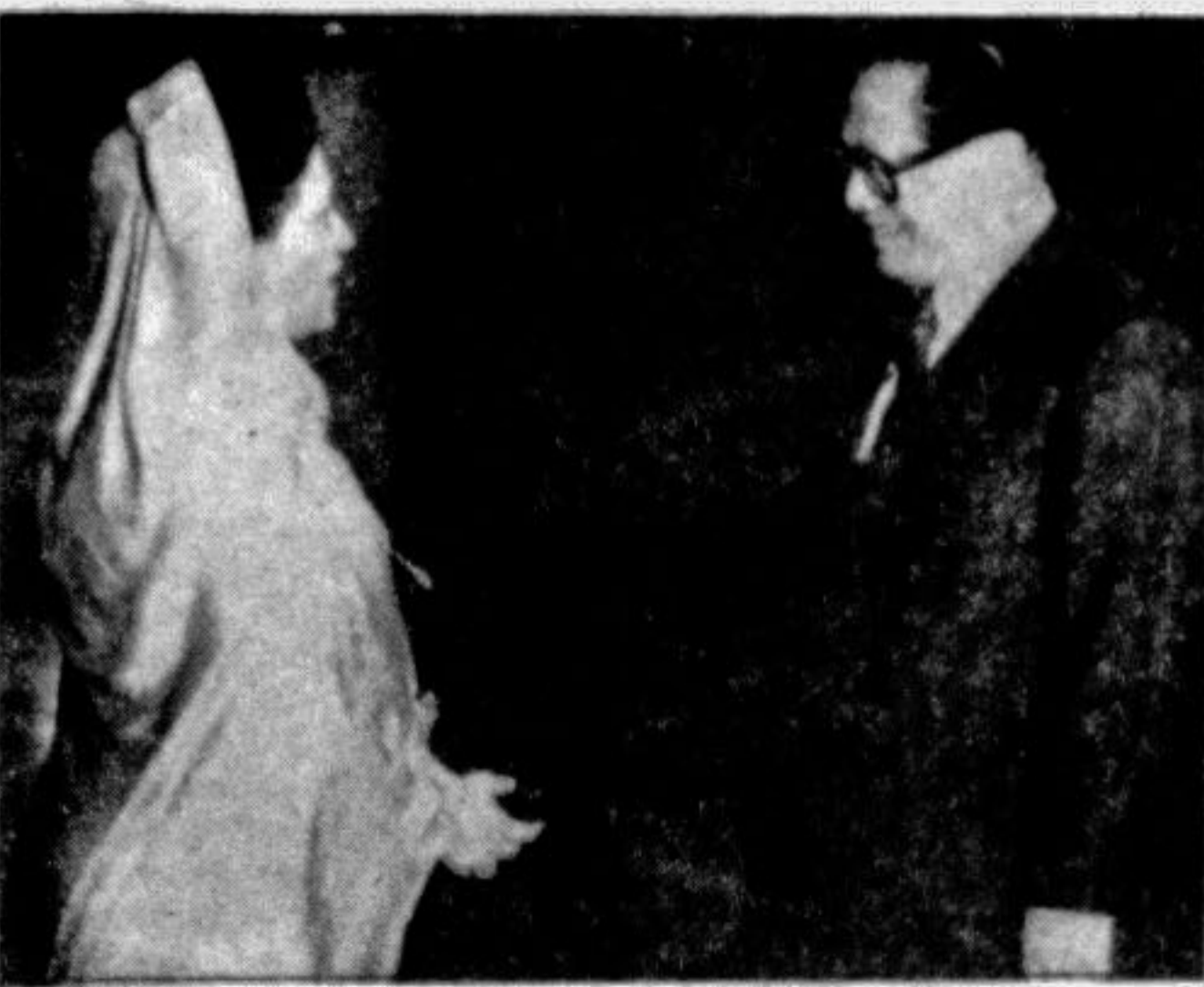
Prime Minister Begum Khaleda Zia is greeted by Chinese President Jiang Zemin yesterday during the official welcoming ceremony in Beijing.