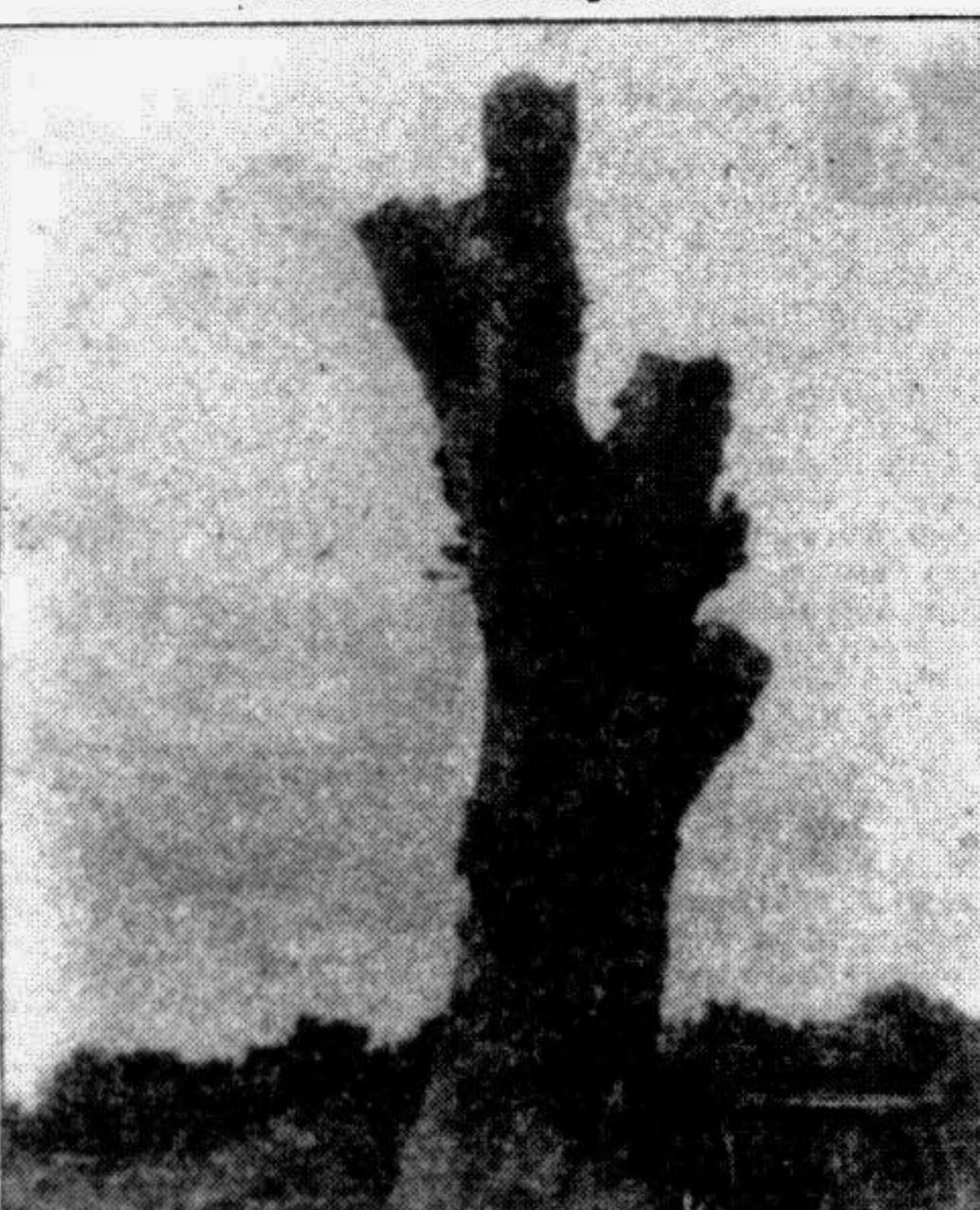
JHENIDAH: A branchless tree is seen near Chhalabhara on Jhenidah-Jessore road.

JHENIDAH, Sept 3: A section of anti-social activists alongwith the help of some dishonest employees of Roads and Highway Department (RHD) have been allegedly looting the trees from Jhenidah-Jessore and Jhenidah-Chuadanga roads rampantly.