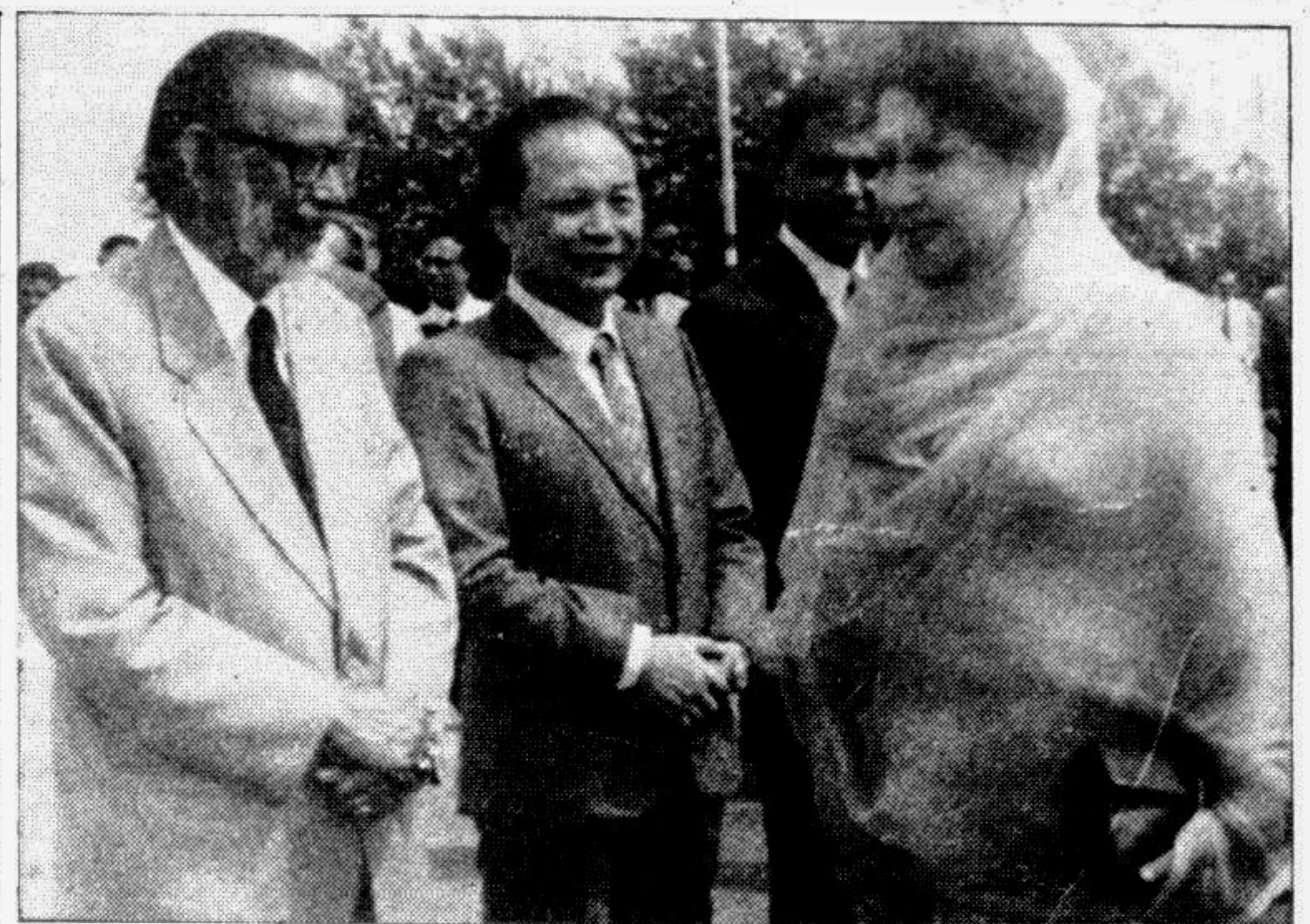
Prime Minister Begum Khaleda Zia was seen off by Law and Justice Minister Mirza Ghulam Hafiz at the, Zia International Airport yesterday on the eve of her departure for Beijing to attend the Fourth World Conference on Women.