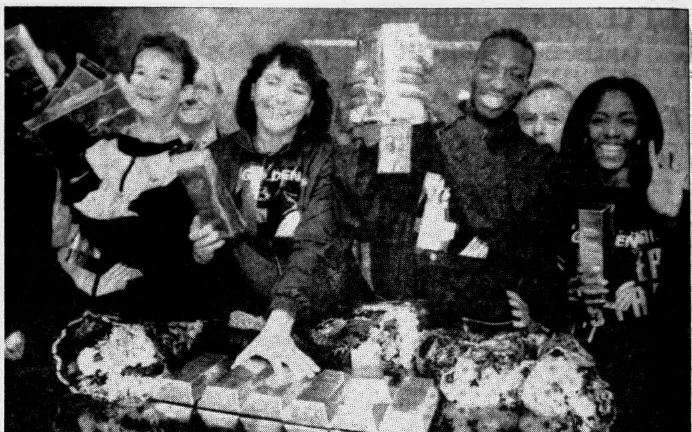
Winners of the "Golden Four" series (left to right), Sonia O'Sullivan (women's 5,000m), Natalya Shikolenko (women's javelin), Michael Johnson (men's 100m) and Gwen Torrence (women's 200m), hold chocolate in gold-bar shape at the end of the Berlin Grand Prix on Friday. The athletes will share the 20-kilogram gold prize for winning the top IAAF meetings this season.

He has been a professional tennis player since he was 13, but it wasn't until he turned 21 that he started to take the game seriously.