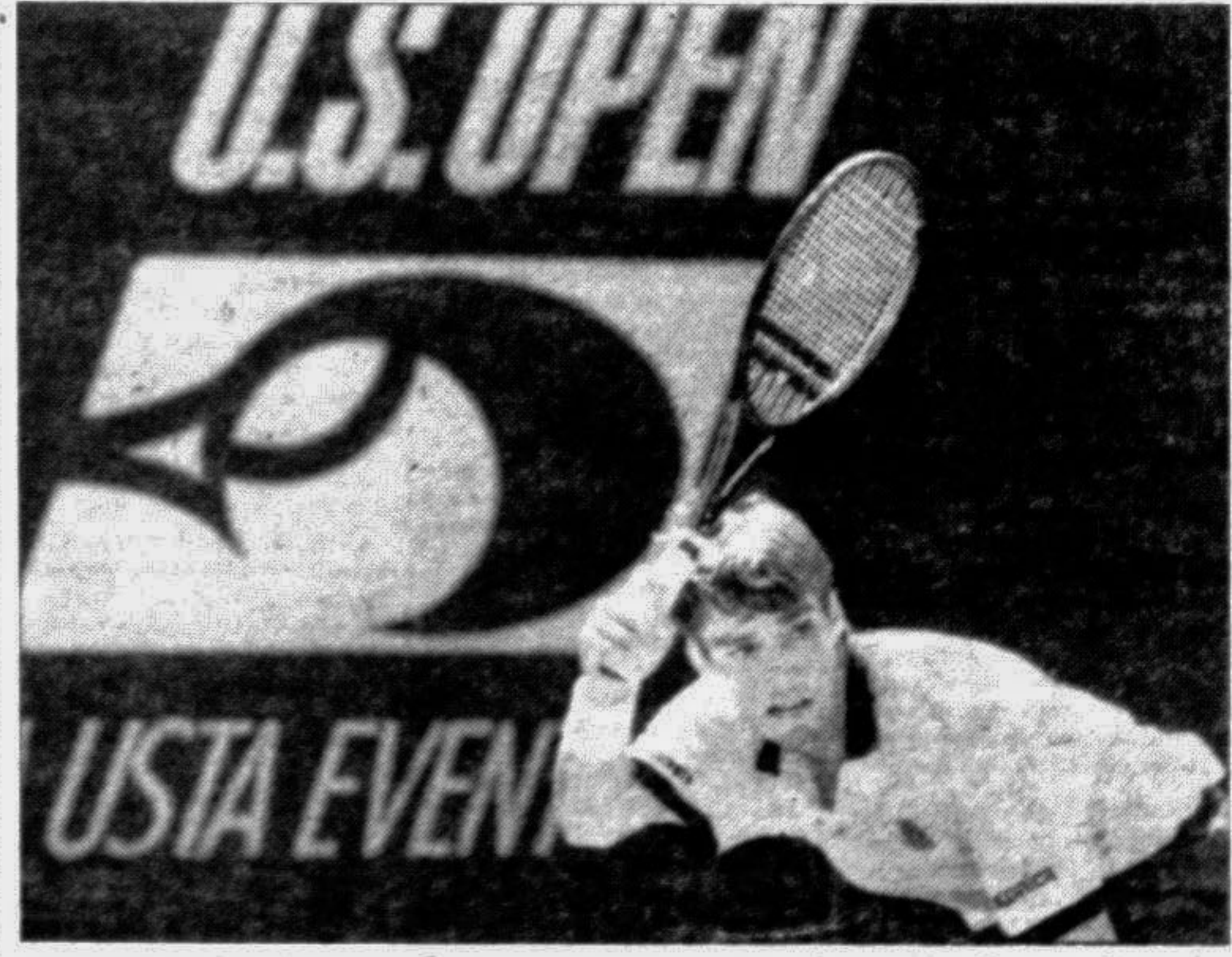
German Michael Stich makes a low down return against Argentina's Herman Gummy in the 2nd round match of the US Open at Flushing Meadows on Friday.