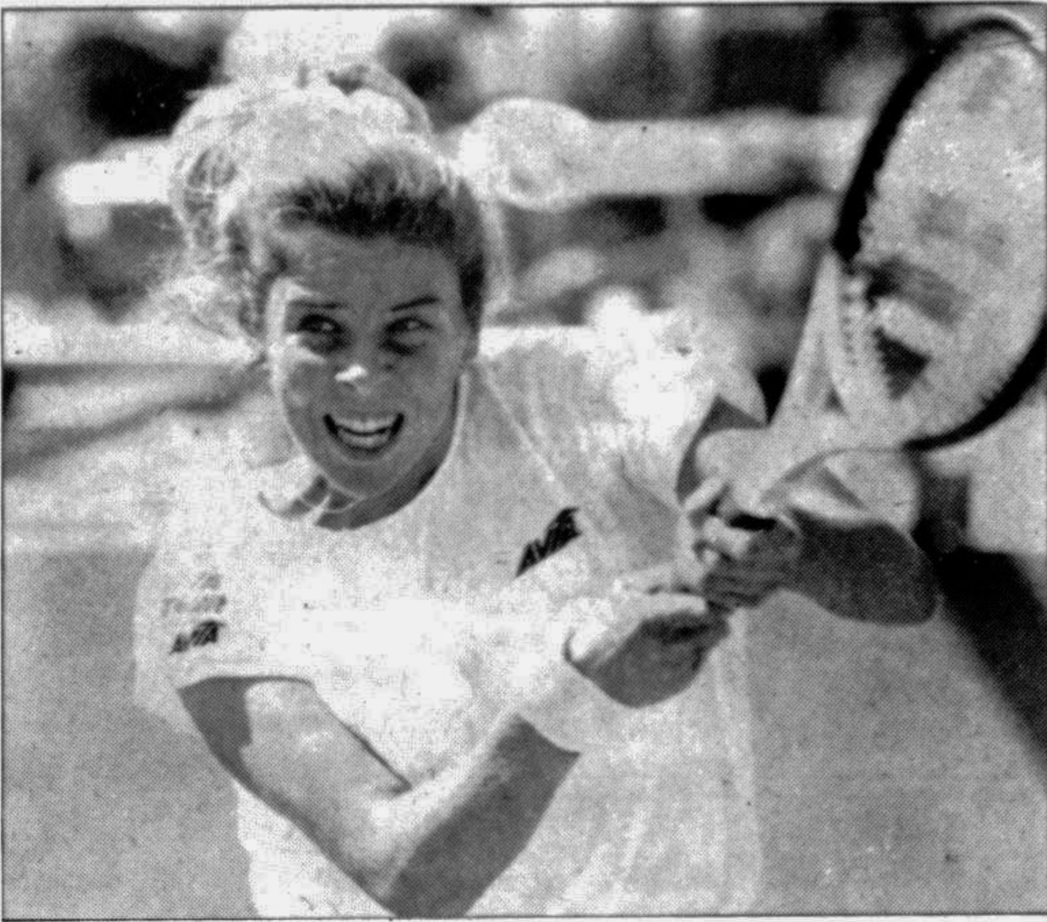
American Amy Frazier plays a forehand return against Mary Pierce of France in the third round of the US Open at Flushing Meadows, New York on Friday. Frazier won the match 6-3, 7-6 (8-6).