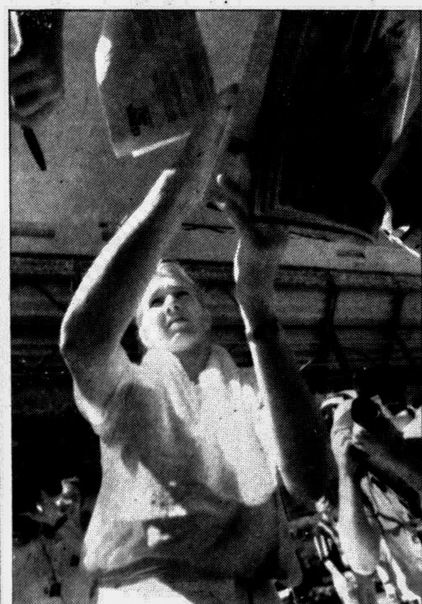
Steffi Graf of Germany signs autographs after her third round match of the US Open against Nathalie Tauziat of France at Flushing Meadows on Friday. Graf won the match 6-3, 6-3.

The Lafayette, Louisiana native should be the fan