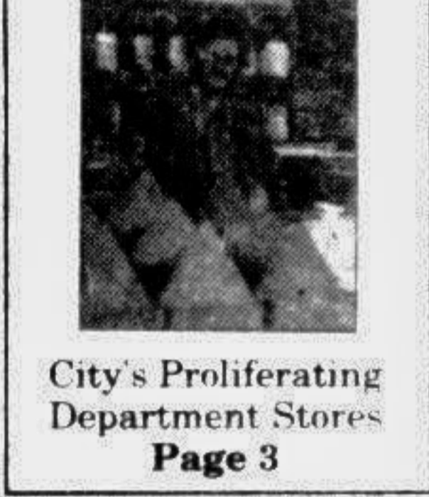
City's Proliferating Department Stores Page 3