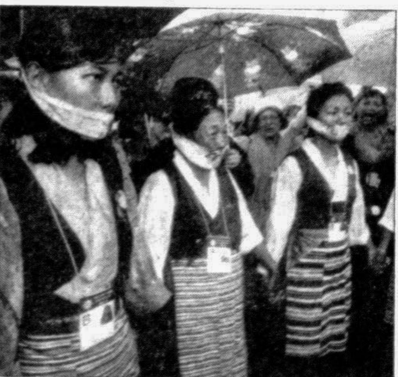
Tibetan women stand in a circle with their mouths gagged as a crowd of delegates to the Women's NGO Forum voice their support yesterday in Hsaiou, China, at a protest to mark the 30th anniversary of the founding of the Chinese-controlled Tibet autonomous region.