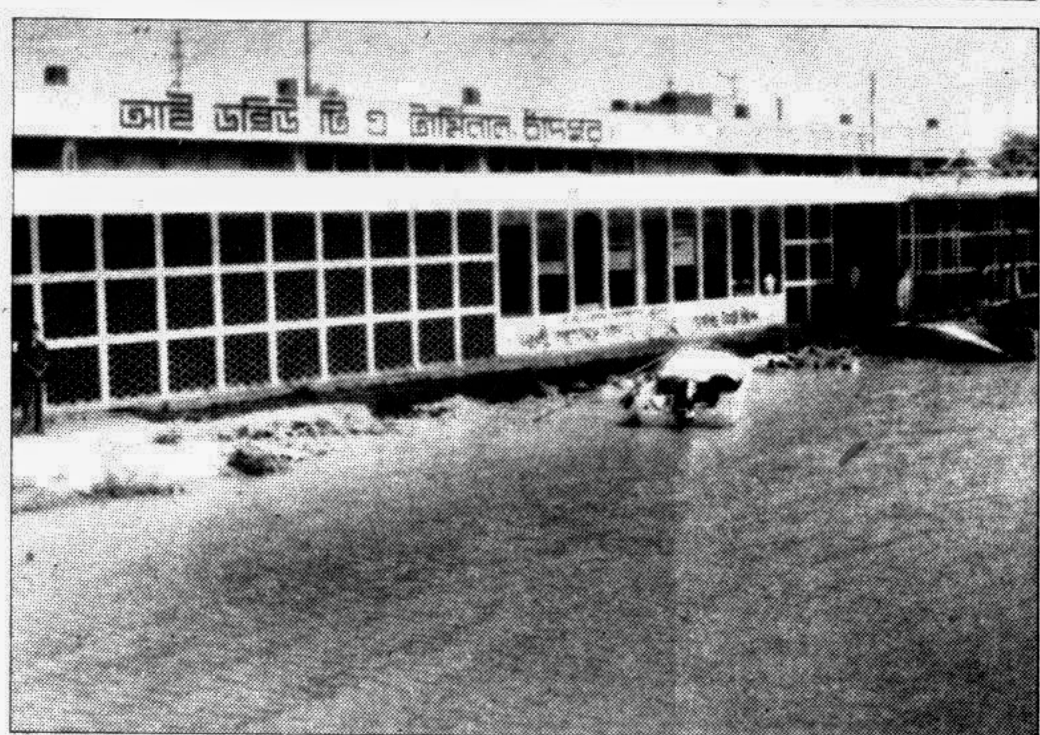
The IWTA terminal at Chandpur is threatened as the rivers Meghna and Dakatia continue to devour more areas in the town.