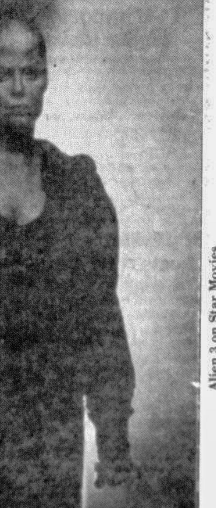
Alien 3 on Star Movies

5:30am Infotainment (TMM) 6:00 Saregana 6:30 Jagran 7:30 A To Z 8:00 Positive Health Show 12:30 Home Shopping (Dubai) 2:30 Grihalaxmi Ka Jimn 9:00 Khana Khazana 3:30 Khoobsurat 4:00 BOURNVITA QUIZ CONTEST 4:30 AKBAR BIRBAL 5:00 A To Z 5:30 Daak Ghar 5:45 Aur Ek Minute 6:30 Neela Kulte Kanama 7:00 Gaane Anjaane 7:30 TBA 8:00 Hum Honge Kanyaab 8:30 CLOSE UP ANTAKSHARI 9:00 PHILIPS TOP 10 9:45 Jalatki 10:00 ANDAZ 10:30 The News 10:50 Business Roundup 11:00 High Life 11:30 Dastaan 12:00 Banegi Apni Baat 12:30 Singer Turnhara Liye 1:00 Laylak (Arabic) 1:30 Zakee (Arabic) 2:00 Infotainment (TMM) 6:00 am Tilawat Aur Tarjuma 8:07 Aaj Ke Programme 8:10 Ha-mid