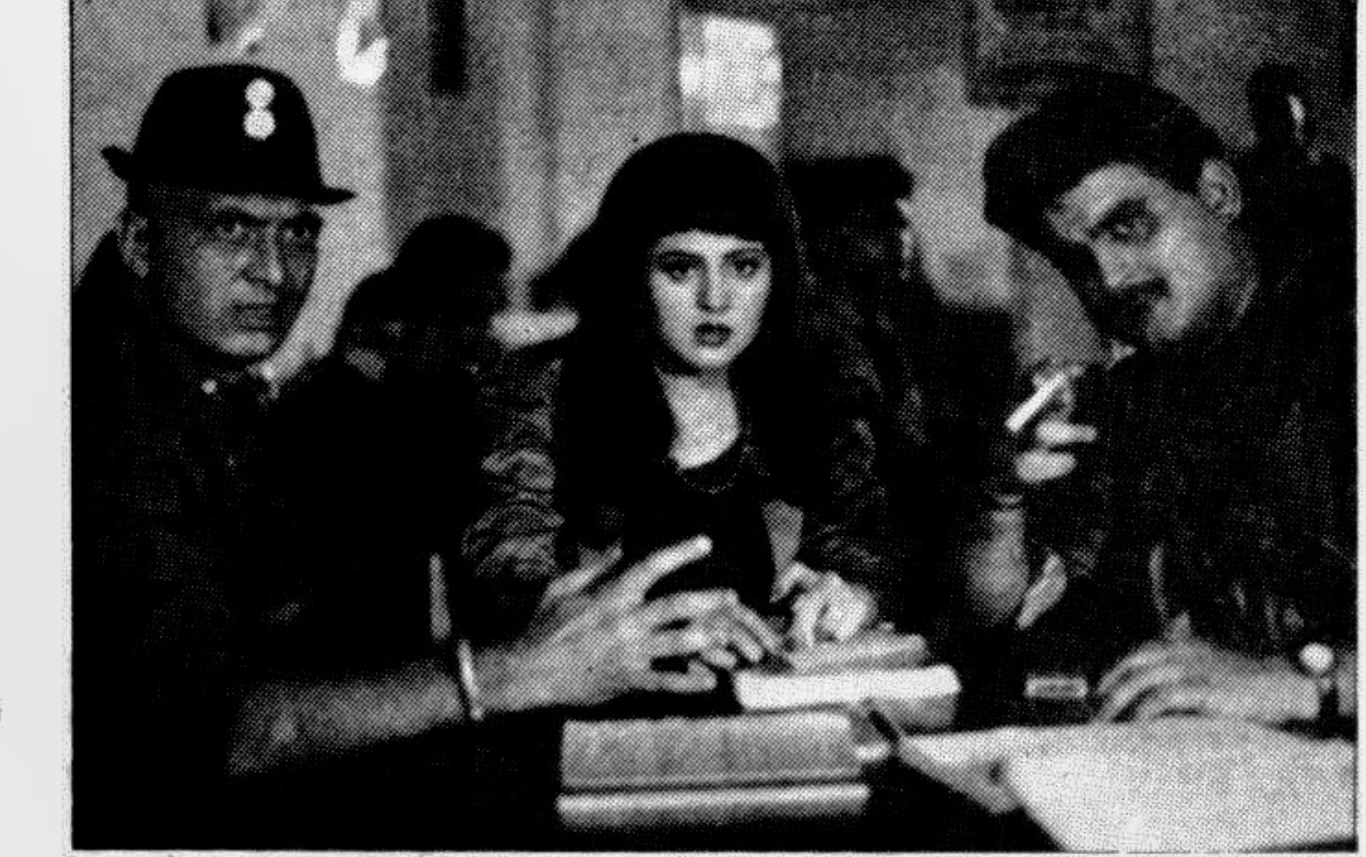
Zee Horror Show: Every Sunday at 10pm, still from Gehraai

10:30 Vira: Pakistan 11:00 Khabrain 11:10 Sada-E-Kashmir 11:20 Hawa'en 12:10 pm Salma Agha Show 12:40 English Classics 1:40 Juma Spot 2:00 PTV2 Insignia 2:02 Bismillah 2:15 Fehm-Ul-Quraan 2:40 Natak Rang (Sindhi) 3:30 Gardish 4:20 Artists Of Pakistan 4:50 Kapas Ki Kasht 5:00 Aasaan Hesaab 5:25 Taleemi Nizam/Biology for 10th/Sehat 6:25 Aiu Courses 7:00 English News 7:20 Time Trax 8:00 The Big Idea 8:45 Duniya 9:00 Headline News 9:02 Duniya 10:00 Khabamama 10:25 Film Music 11:35 Current Affairs Programme 11:55 Friday Night Classic Cinema Khas Khas Khabrain/Farman-e-Elahi/Close Down