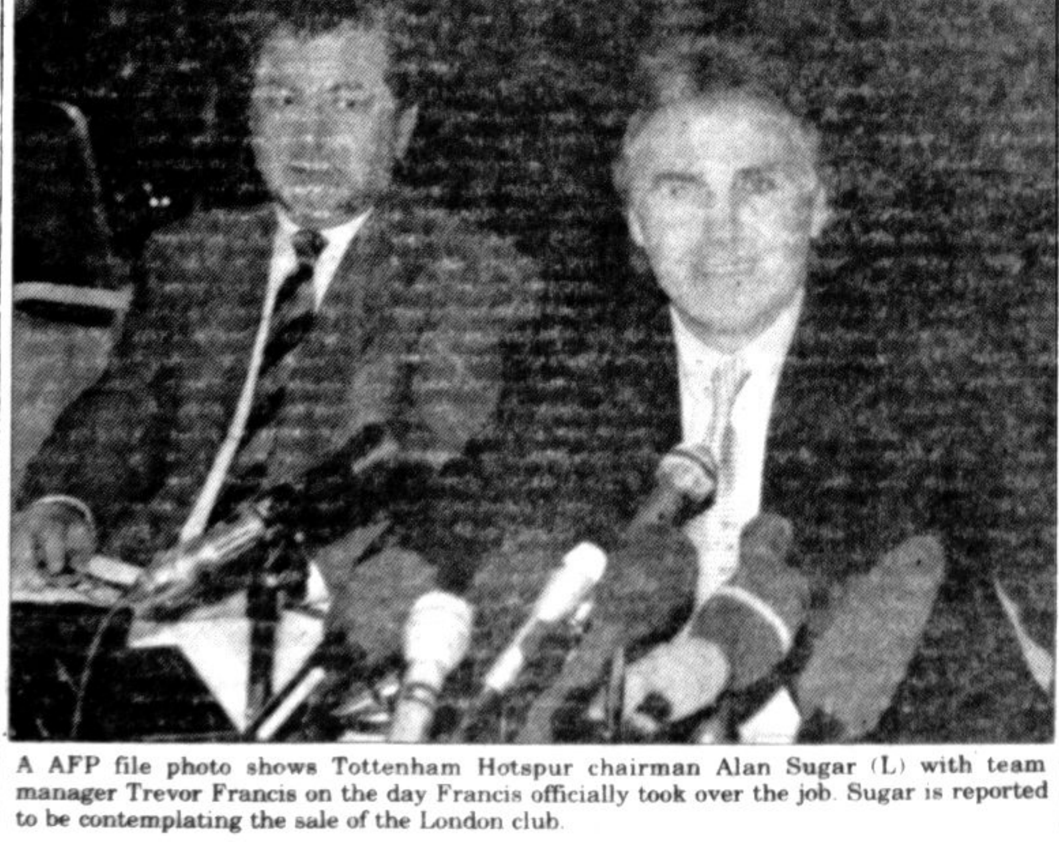
A AFP file photo shows Tottenham Hotspur chairman Alan Sugar (L) with team manager Trevor Francis on the day Francis officially took over the job. Sugar is reported to be contemplating the sale of the London club.

TOKYO, Aug 30: Mexican striker Carlos Hermosillo scored a hatrick helping the Pan-American All Stars crush the Rest of the World team 5-1 in an international charity soccer match today, reports Reuter.