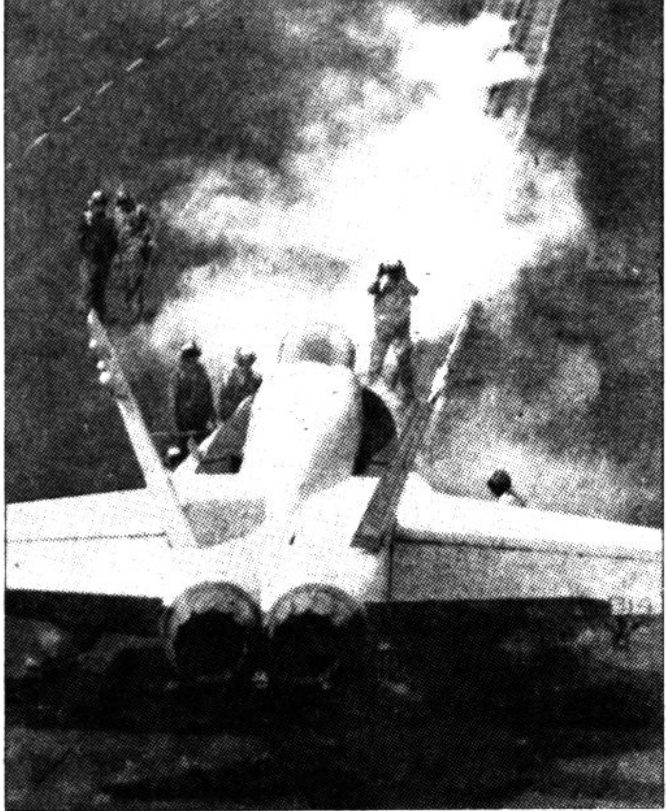
File picture dated May 31 this year of the catapult launch of a jet fighter F/A 18 on the deck of the US aircraft carrier Theodore Roosevelt during manoeuvres in the Adriatic Sea. Sixty NATO combat aircraft took part in a first wave of attacks on Bosnian Serb targets yesterday.

SARAJEVO, Aug 30: More than 60 NATO aircraft backed by artillery of the UN Rapid Reaction Force made massive attacks on Bosnian Serb position all round Sarajevo early today in retaliation for Monday's mortar attack on the city that killed 37 people, UN and NATO sources said, report AFP, AP. In the biggest NATO action yet since the organisation's founding in 1949, three waves of warplanes struck between 2 am and 9 am (0000 and 0700 GMT). UN sources said NATO jets also targeted Bosnian Serb air defences near the towns of Mostar in the west, Gorazde in the east, and Tuzla to north, but there was no immediate NATO confirmation. The United Nations said there were no NATO or UN deaths. But the Bosnian Serb news agency SRNA claimed NATO air raids killed 12 people in Serb-held areas of Sarajevo, including five European Union observers. The agency, quoting non-official sources, added that an unspecified number of dead and wounded were taken to the Korean hospital in Pale. The first explosions were heard from the direction of Sarajevo, UN sources said. See Page 12 Col 4