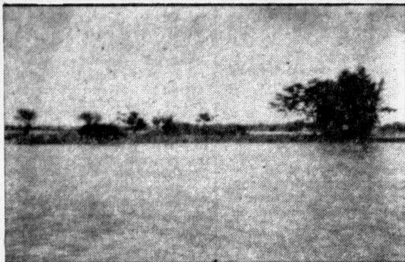
PABNA: A big grave-yard in Faridpur thana still under water causing burial problems.

Tomen Ali of Dutta Punguli village used to work as a day labourer. Following the flood he and his family of nine