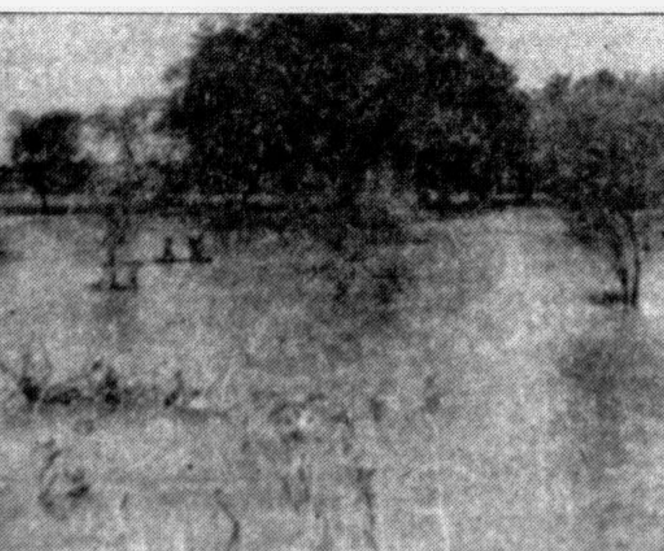
PABNA: Vast tract of land with standing crops damaged due to inundation by flood.