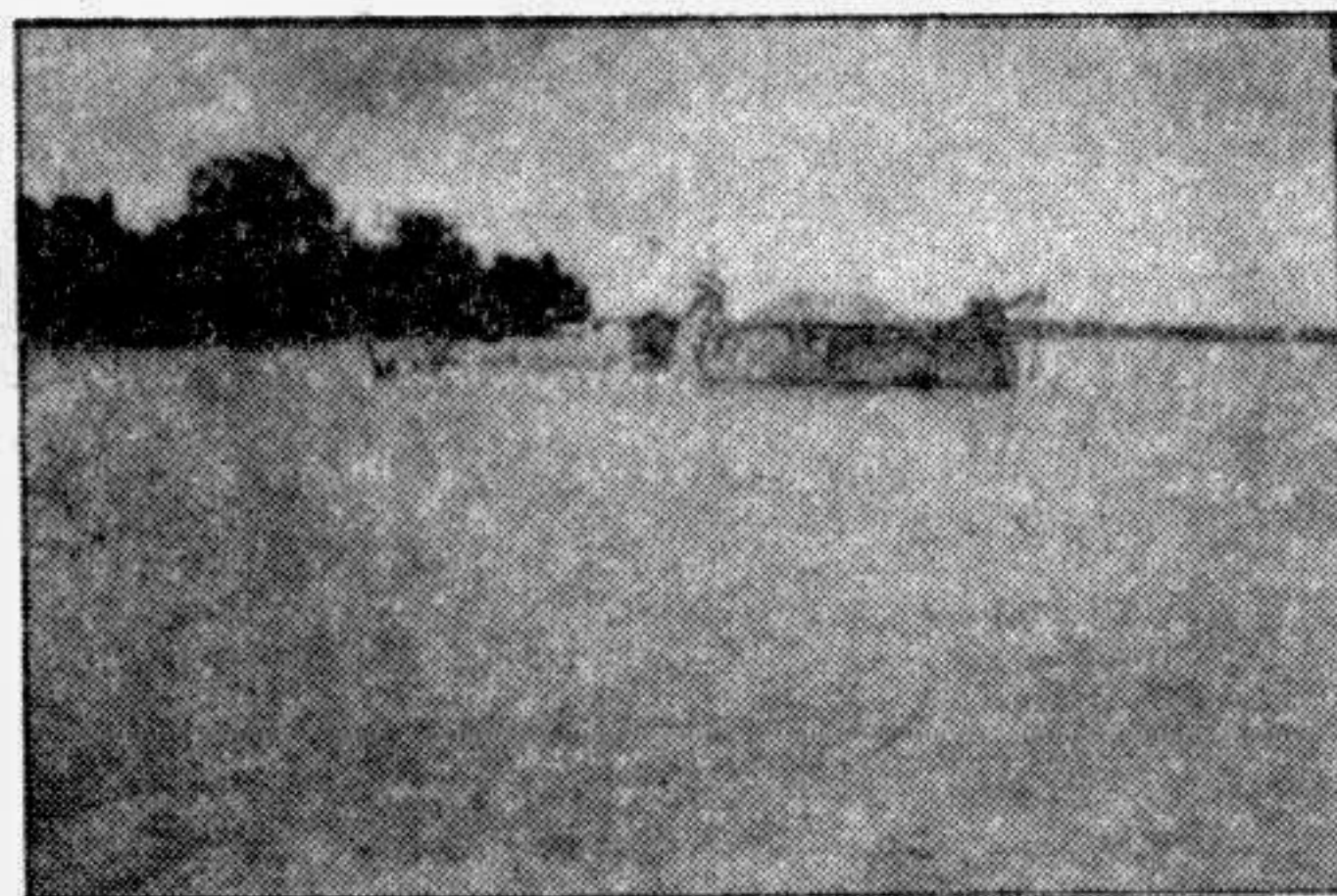
PABNA: Entire area, with standing crops in Faridpur thana still lies under water.