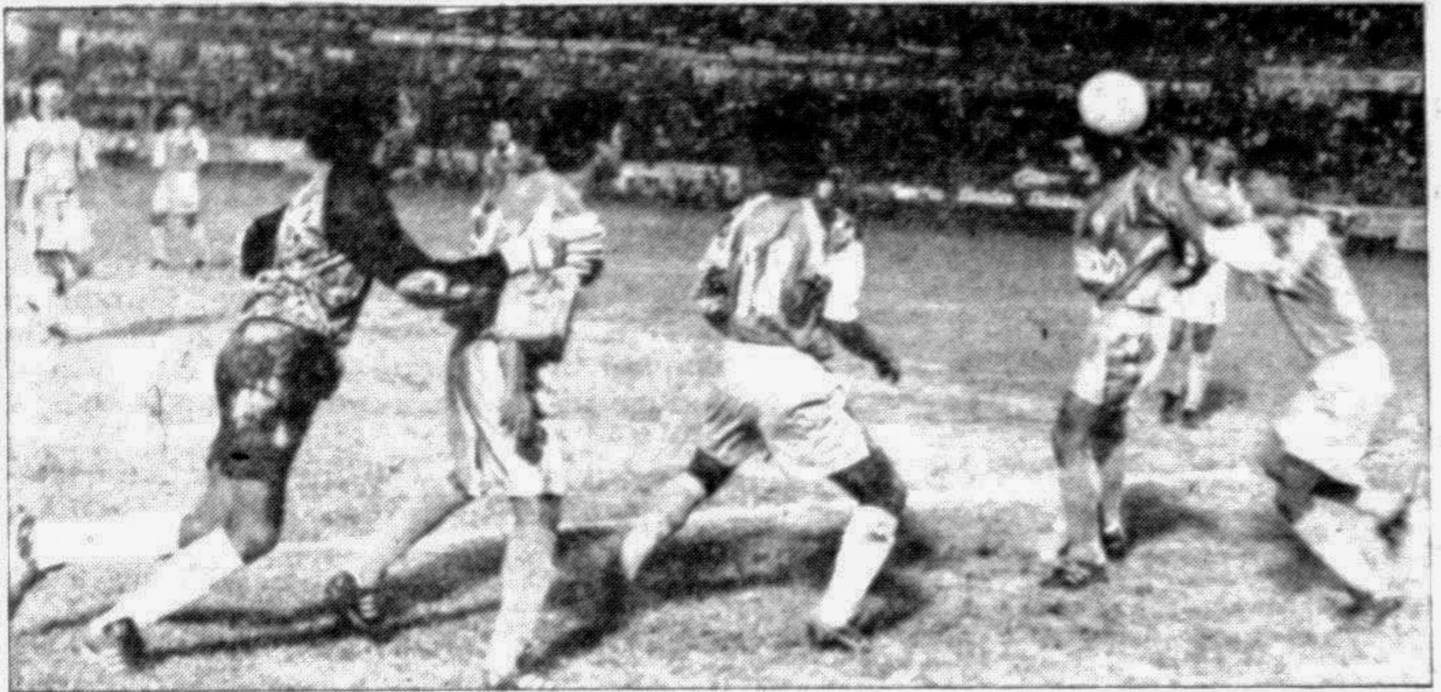
Confusion in front of the Young Men's small D that eventually resulted in an own goal in favour of Abahani during yesterday's tense Lifebuoy Premier League clash at the Dhaka Stadium. Runaway leaders Abahani were shocked

The vanquished Hong Kong team will face holders Great Britain today in 5th