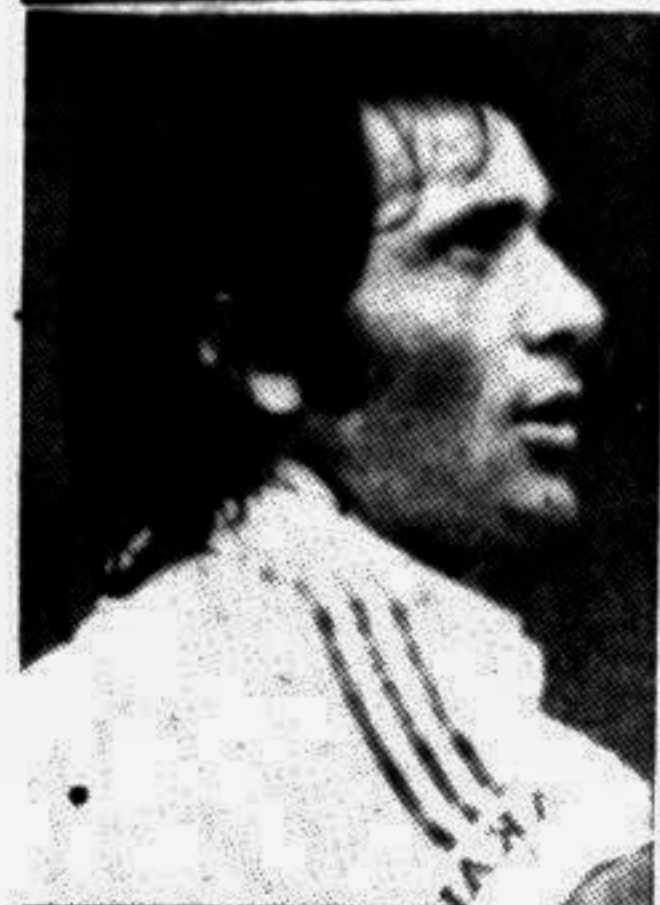
Ilie Nastase (Romanian tennis star) 'I was always rather nasty. I was willing to be friends with Devil, just to cross the bridge.' (1972)