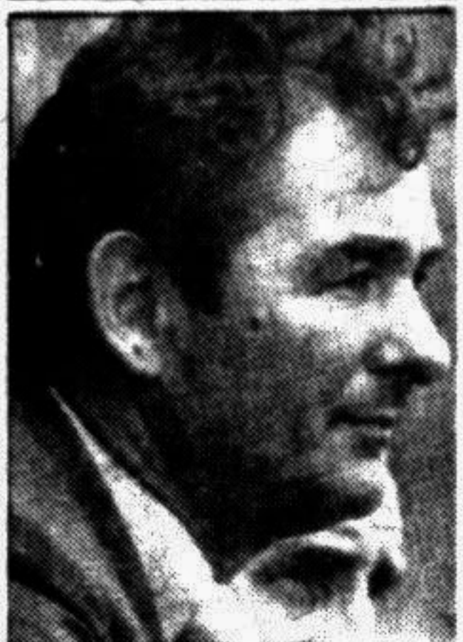
Brian Clough (Soccer manager)

I tell you what, I've got for greater feelings for the players than they've got for me.