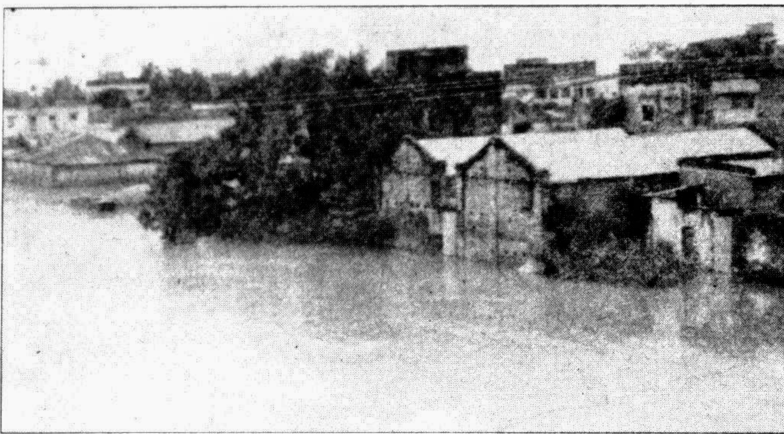
RAJSHAHI: The river Chota Jamuna overflowed and entered the Naogaon town flooding one-third of the municipality area.

RAJSHAHI, Aug 26: The devastating flood for the second time in Naogaon district has submerged huge areas including one third area of the town and most of the low lying places in 30 unions of seven thanas of the district.