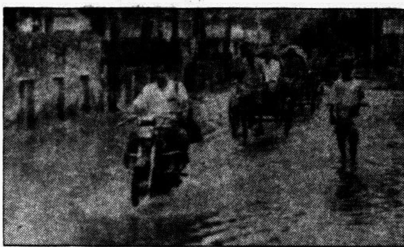
RAJSHAHI: Flood waters submerged town areas of Naogaon disrupting normal life.

Ganges Kobadak Project, gigantic irrigation project of the country has been facing a serious set back as the 3000 feet long intake channel linking the river Ganges has been badly damaged by ero-