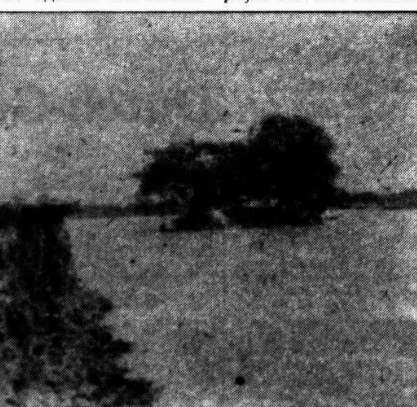
RAJSHAHI: A road was washed away in Manda thana of Naogaon district by the recent floods.

The erosion also affected main canal of Ganges Kobadak Project seven miles from Kushtia town in Chapra Union of Kumarkhali thana. The project authority have been spending huge amount of money every year to protect the banks to save their project. Large number of houses on the bank of the project have been devoured