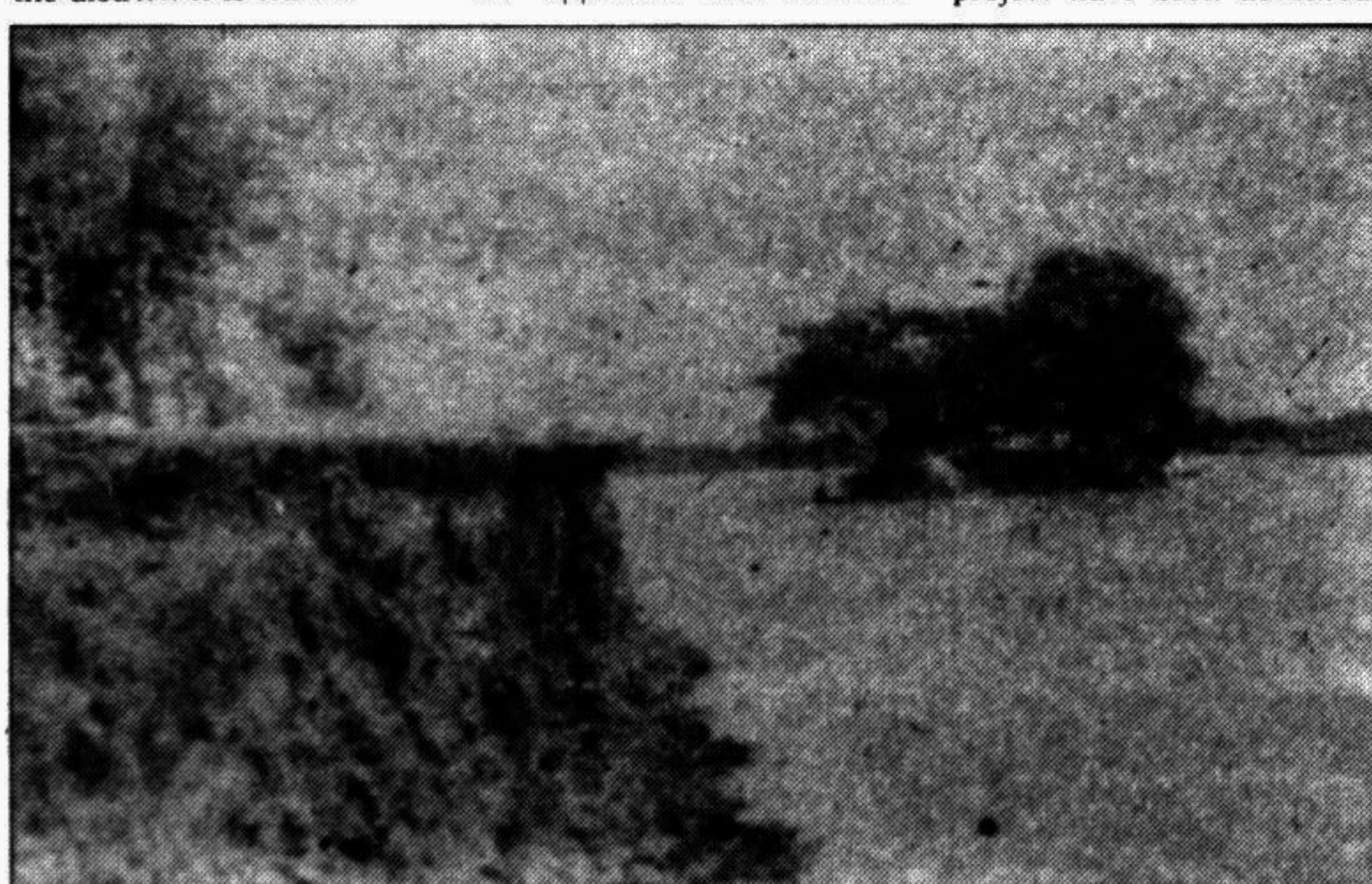
RAJSHAHI: A road was washed away in Manda thana of Naogaon district by the recent floods.

The government sources, however, said that more allocation would be granted in needed. An extensive post flood rehabilitation programme will soon be started in the district, it is learnt.