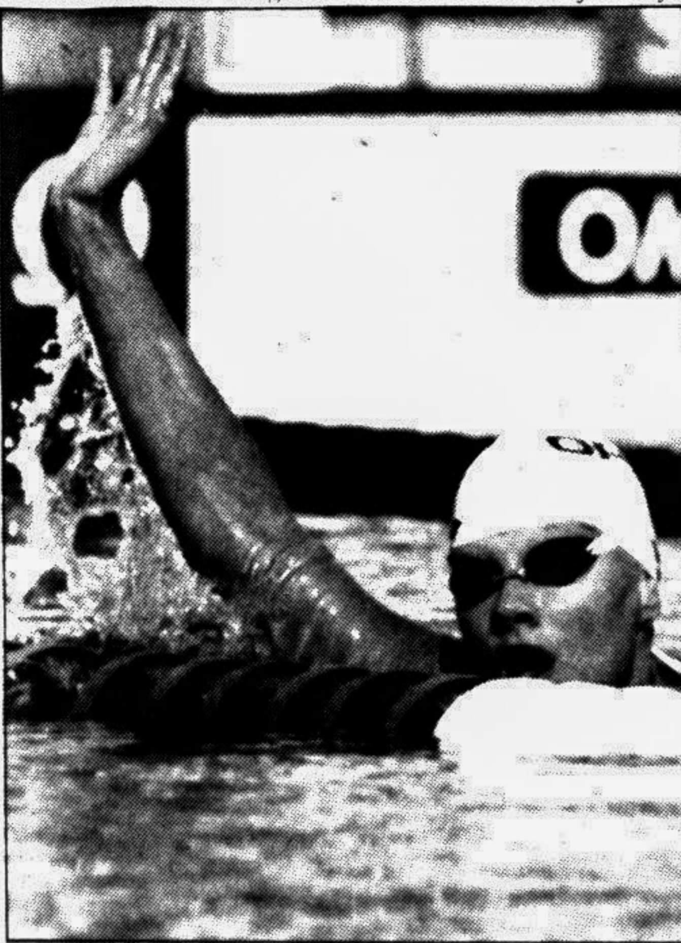
Germany's swimming ace Franziska Van Almsick raises her hand after winning the 100 metres freestyle final at the European Swimming Championships in Vienna on August 22.

The 17-year-old German began with a clearcut win in the opening women's 100 metres freestyle and brought proceedings to a predictable conclusion in the late afternoon sunshine by anchoring Germany to victory in the 4x200 metres freestyle relay.