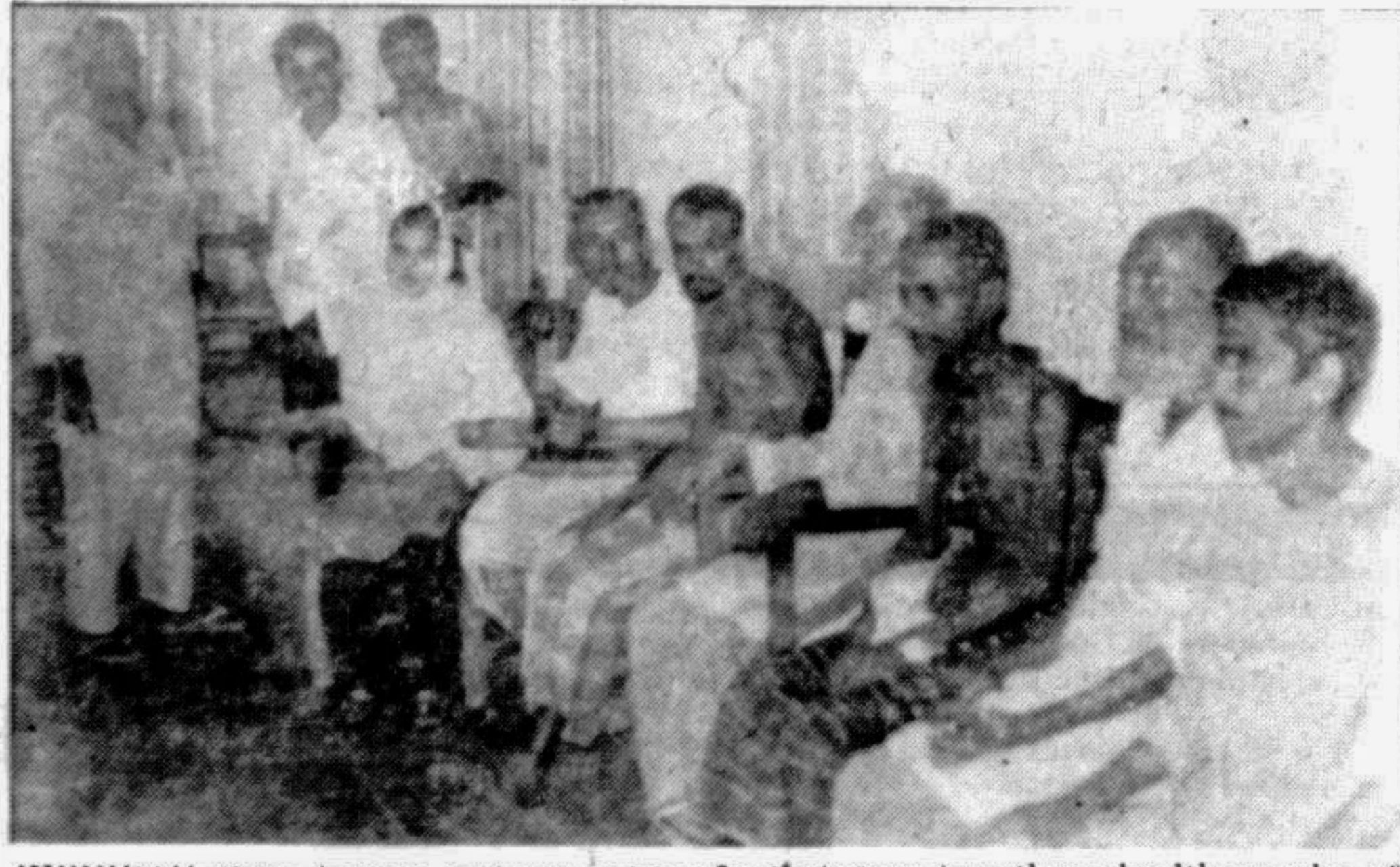
JHENIDAH: Some leprosy patients waiting for their turn in a thana health complex of the district

The medical officers further informed that most of the TB and leprosy affected patients do not disclose their diseases for shame. To remove this mentality the people must be made aware.