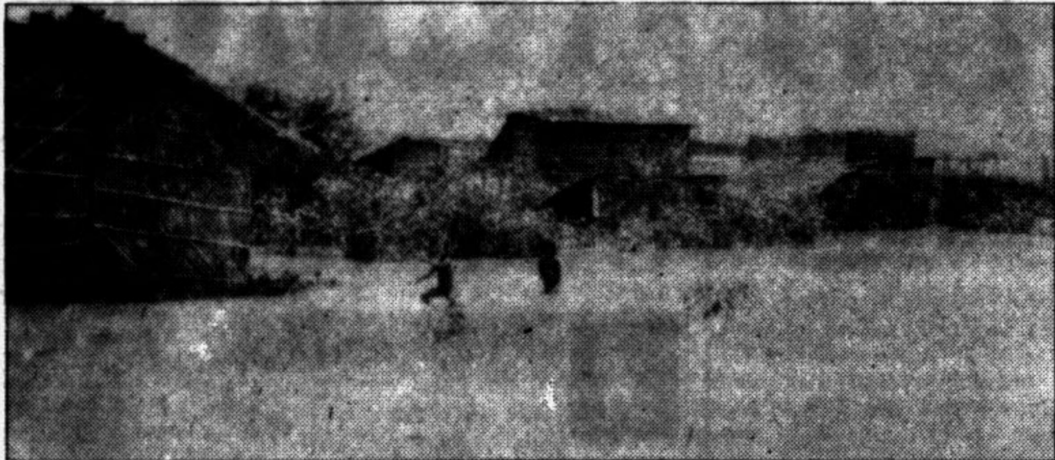
RAJSHAHI: Dargahpara village in the city corporation area went under flood water recently

Meanwhile, diarrhoea and other viral diseases have broken out in the flood affected areas but no medical teams was formed yet it is alleged.