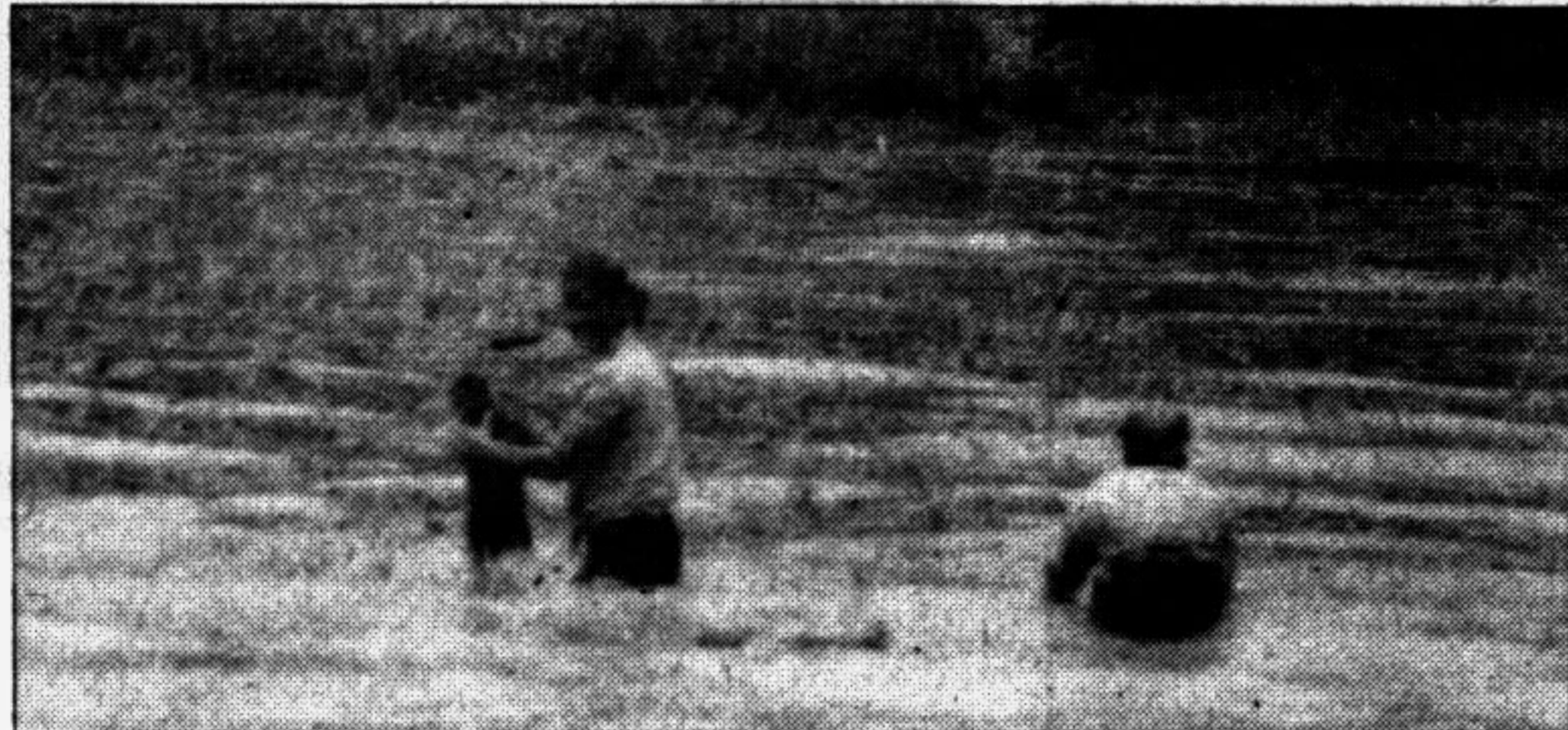
RAJSHAHI: People harvesting ripen aus paddy submerged by flood water. The photo was taken from Kamargaon of Tanore thana on Aug 20.