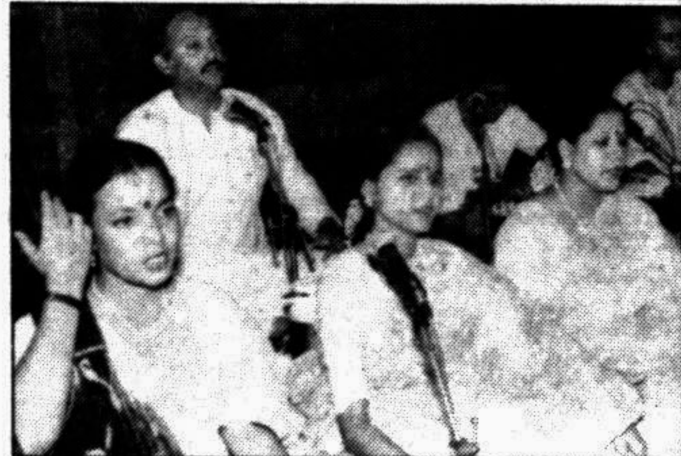
Artists of noted musical group Anandadhvani performing Tagore songs at the Shilpakala Academy auditorium in the city yesterday.