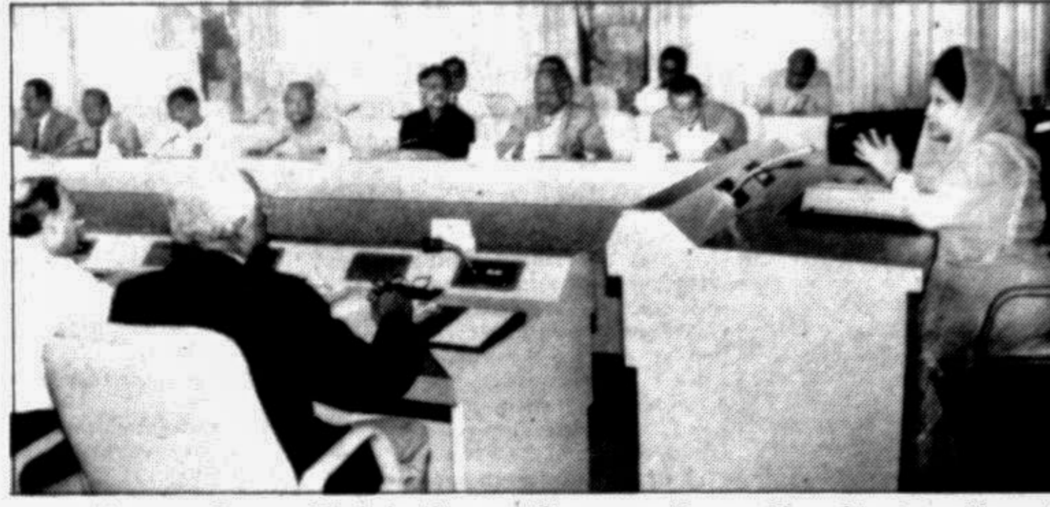
Prime Minister Begum Khaleda Zia presiding over the weekly cabinet meeting at Bangabhaban yesterday.