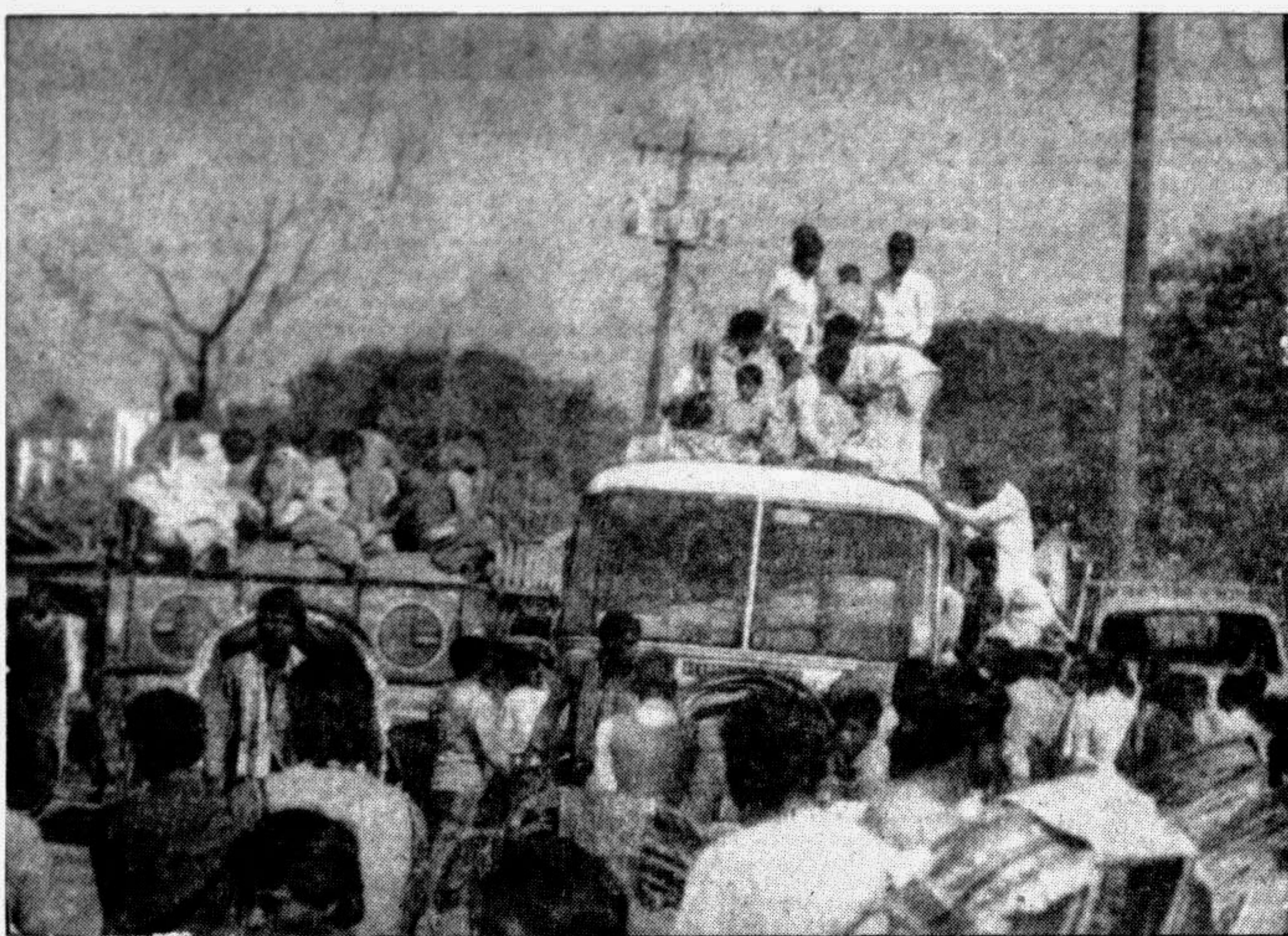
SIRAJGANJ: A COMMON SCENE: Overloading, carrying passengers on roof-tops of buses, is a regular feature in Sirajganj-Bogra route.

Interested people have urged the authority to renovate the picnic and resting corner by re-excavating the pond and installing at least two new tubewells. They also demanded the full time service of the spot staff for safeguarding its assets.