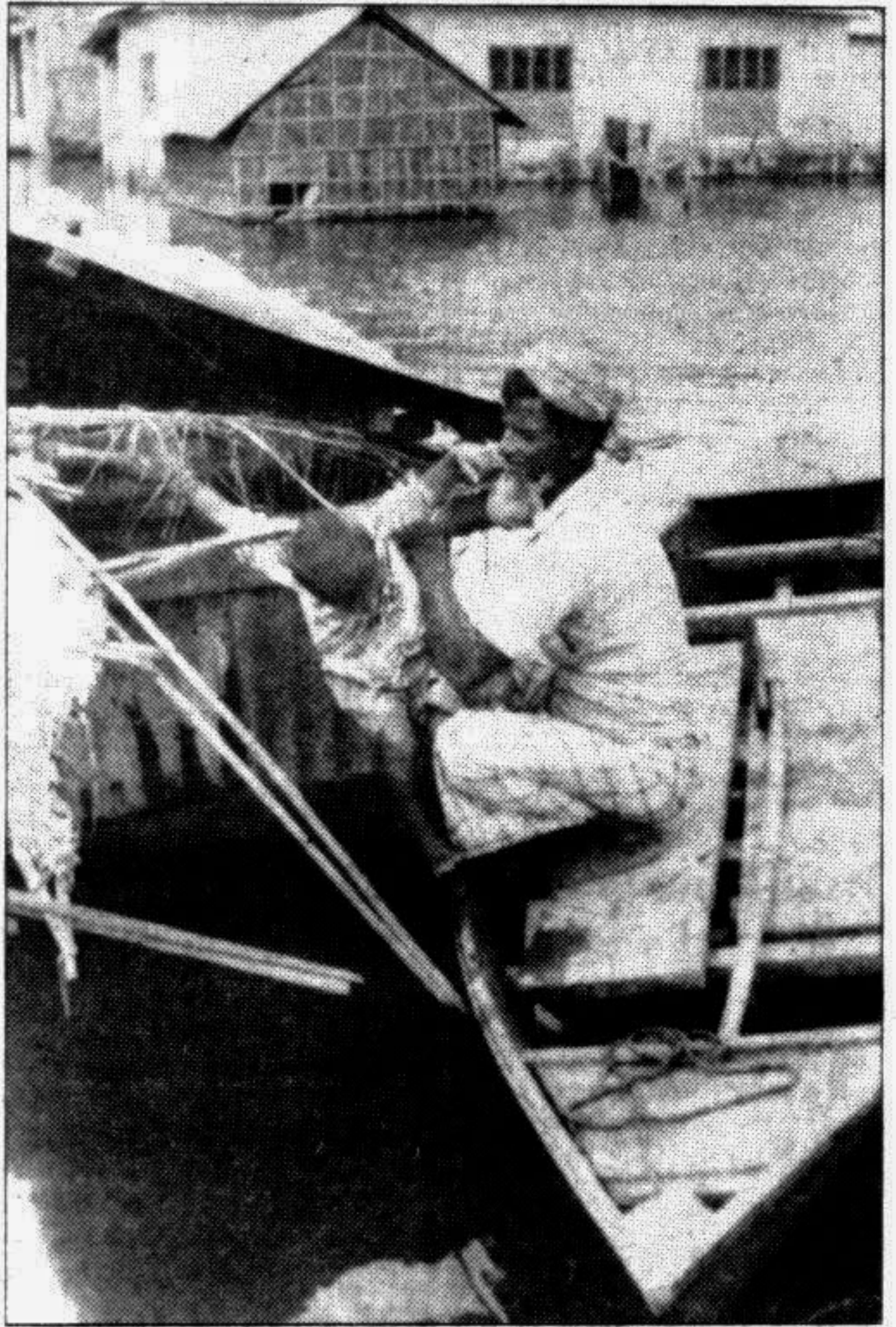
An old man is taking a child out of his partially submerged house in North Jatrabari area of the city yesterday.

By Staff Correspondent Fresh areas in Dhaka, Narayanganj and adjoining districts were submerged as rivers in the region continued to swell with waters rolling down from the upstream northern region. More low-lying areas in and around the capital reeled under water. The flood waters, however, started receding from the affected northern districts of Rajshahi, Chapai-