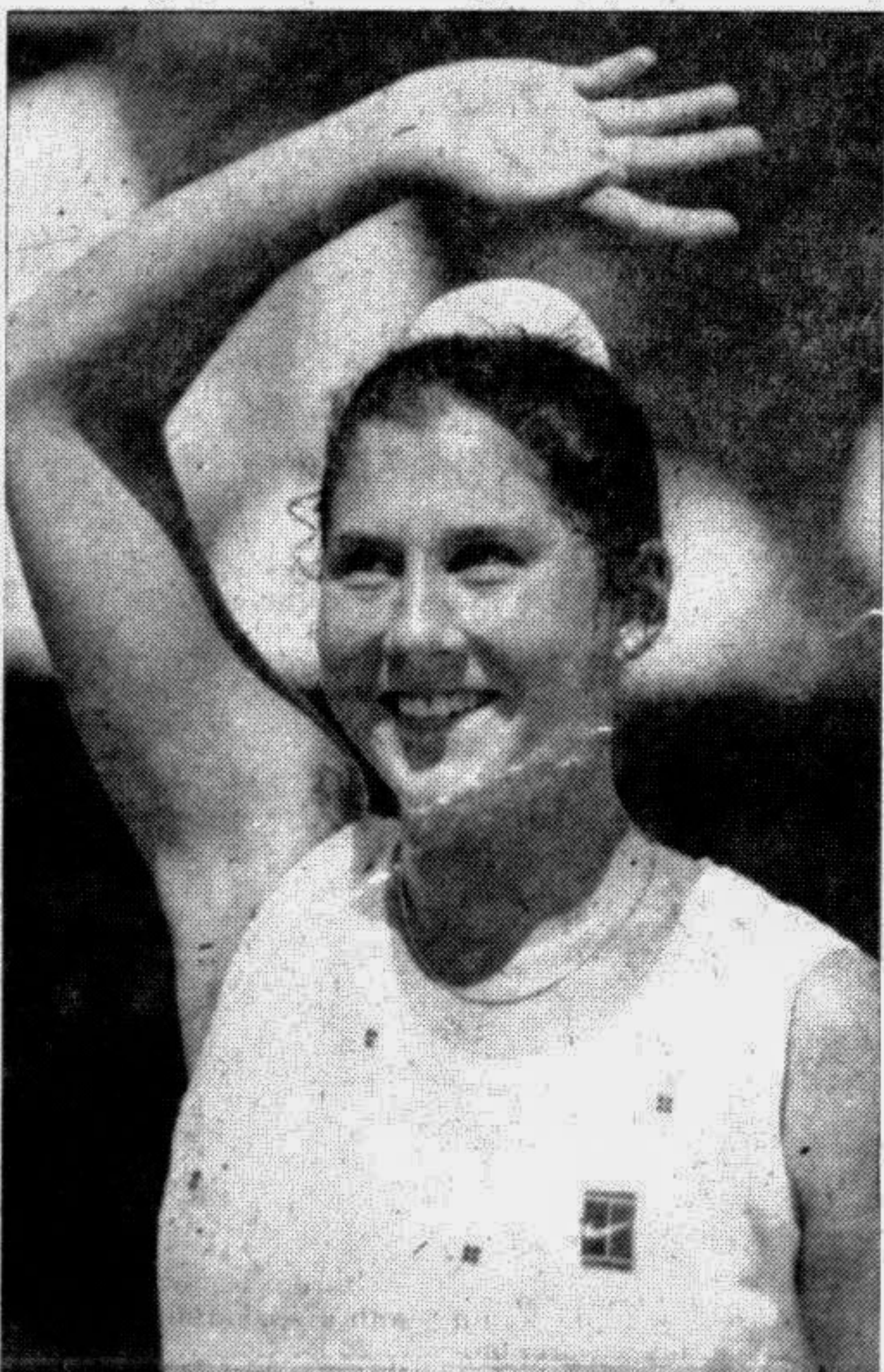
A beaming Monica Seles acknowledges her fans after crushing Gabriela Sabatini of Argentina 6-1, 6-0 in the semifinal of the Canadian Open in Toronto on August 19.

Informed that Coetzer has a chance to become the first player ever to defeat two number-one players in one week, Coetzer smiled and commented, "that's quite an opportunity."