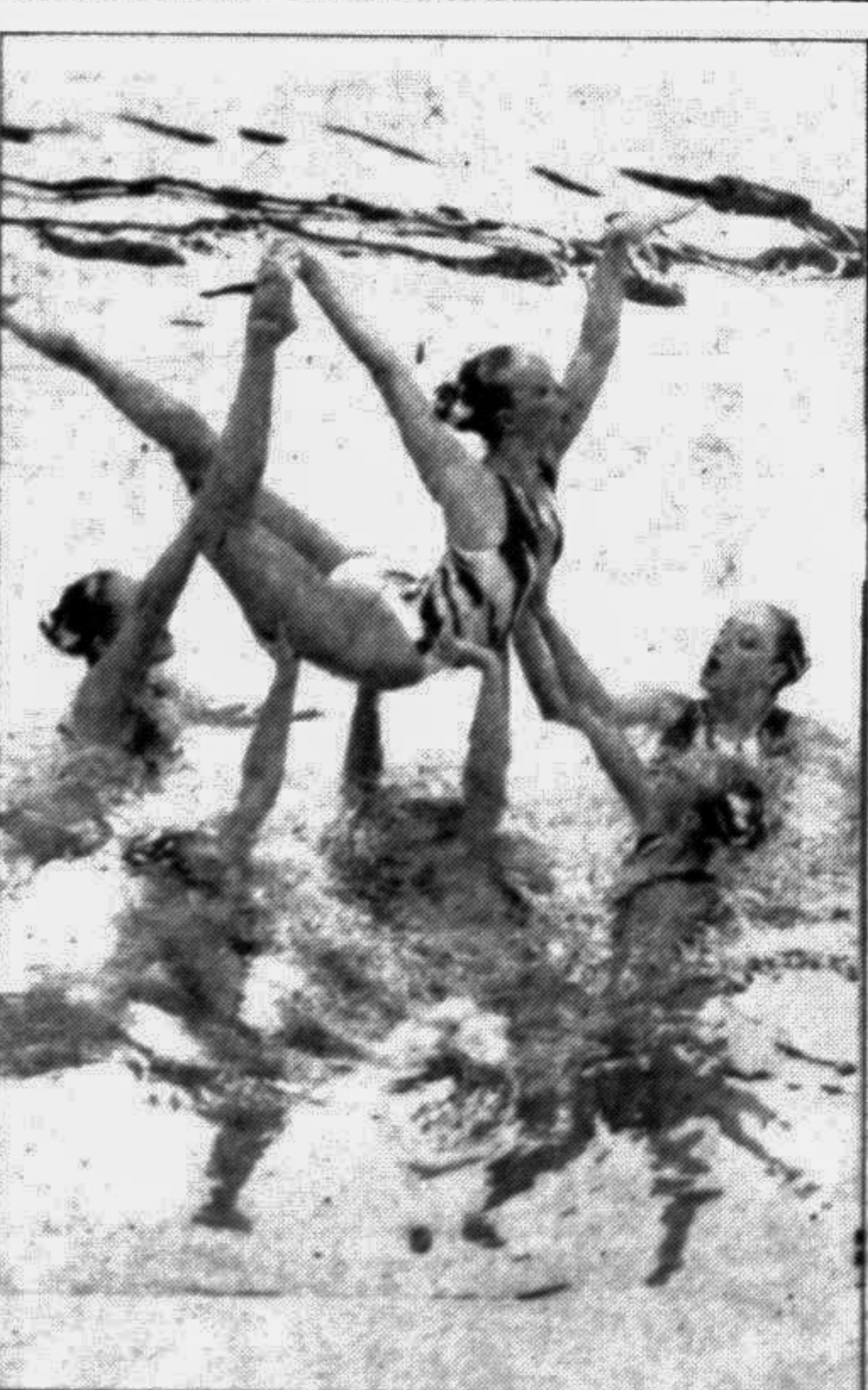
Russian synchronical swimmers display their artistry during the European Swimming Championships in Vienna on August 19.

But Enqvist prevailed in the third set on a weak service game by Ivanisevic. In the sixth game, Ivanisevic served two double-faults, including one on game point, to lose his serve.