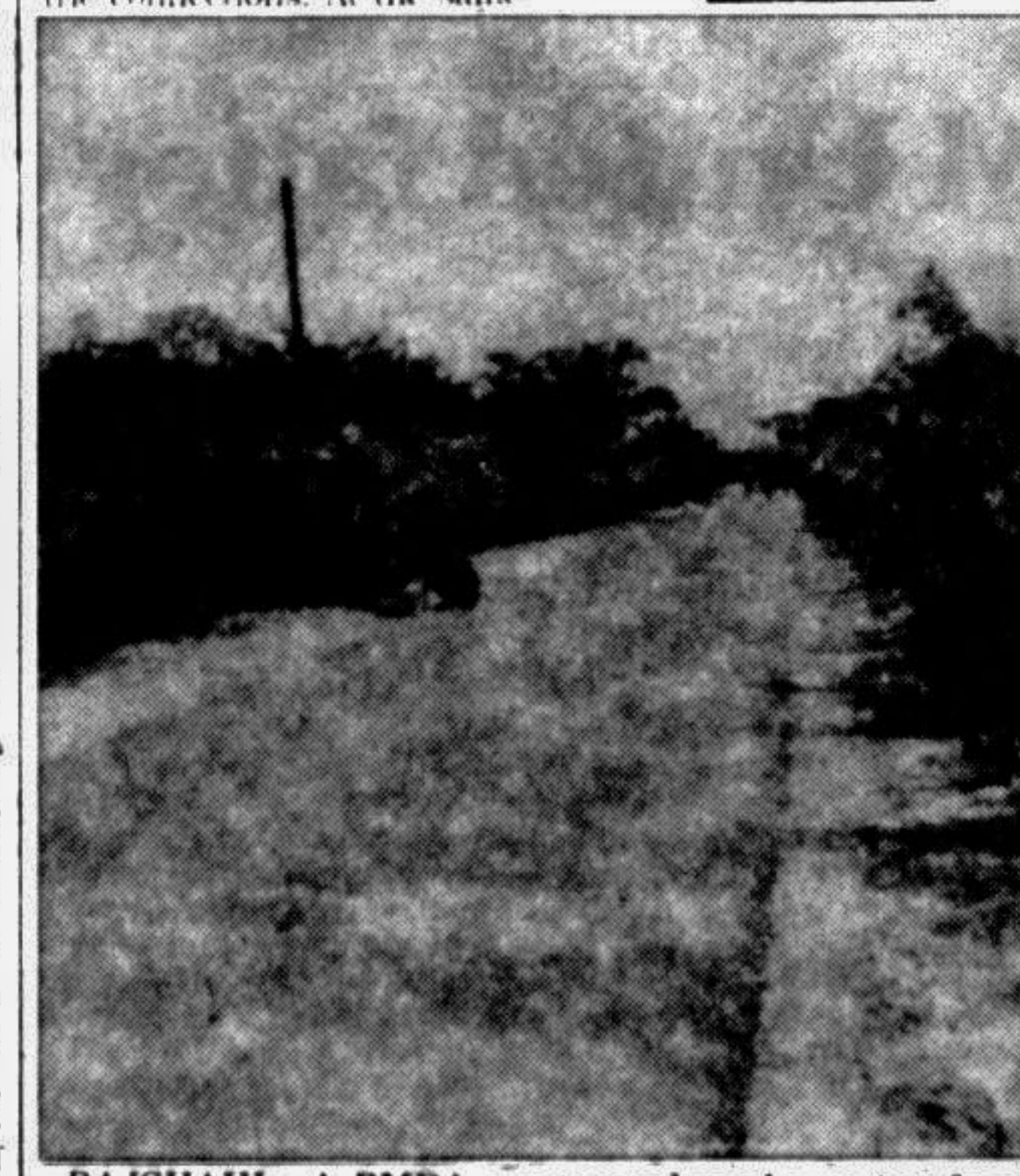
RAJSHAHI: A BMDA-constructed road running from Badalgachi to Naogaon. Alongside the road are growing plants and electric lines and six people are seen to take care of the road and the plants.

Of the projects, five were implemented in agriculture and irrigation sector, 12 in education, seven in transport and six in small and cottage industry sectors.