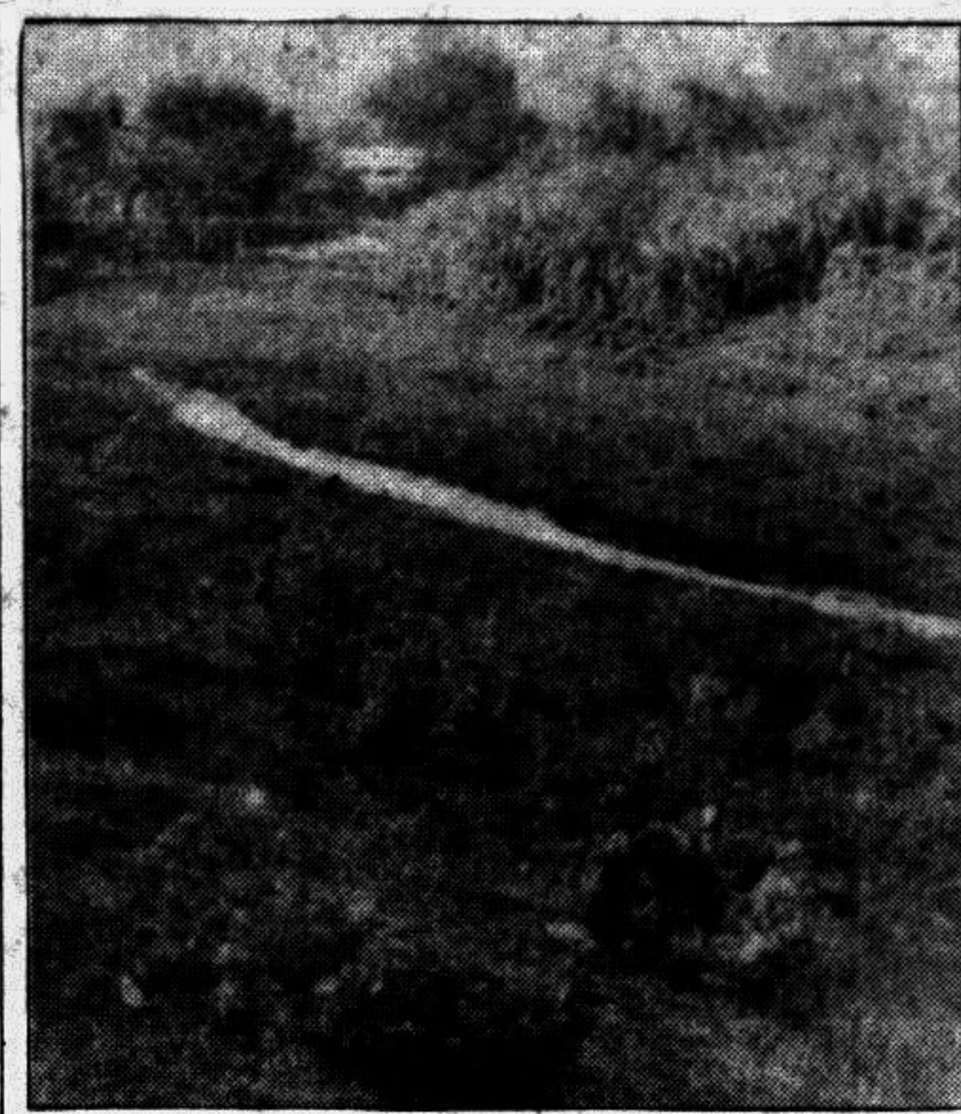
NATORE: This is all that remains of river Narod at Tebariahat area. Heavy siltation has reduced the river to a mere canal.

The districts are Mymensingh, Jamalpur, Sherpur, Kishoreganj and Netrakona. Under this programme aman seedlings would be raised on 8581 hectares of land at a cost of Tk 1.77 crore. The seedlings will be supplied to the flood stricken farmers in the area free of cost.