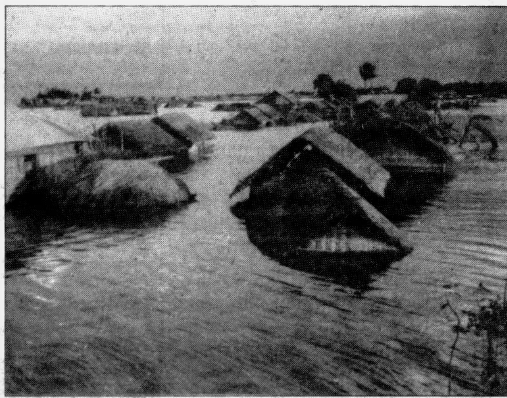
Flood-affected Rasoolpur area in Gaibandha district.

By Staff Correspondent Awami League General Secretary Zillur Rahman said yesterday that his party was not interested in any sort of dialogue with the ruling BNP which, he said, breaches trust. "We are now determined to carry forward our agitation programmes to compel the ruling party to accept the popular demand for a non-party caretaker government to conduct the next general elections," he told The Daily Star when asked about the ruling party's move for a fresh dialogue. BNP Secretary General Abdus Salam Talukdar had earlier told The Daily Star Saturday that his party was ready to sit for a dialogue See Page 12 Col 1