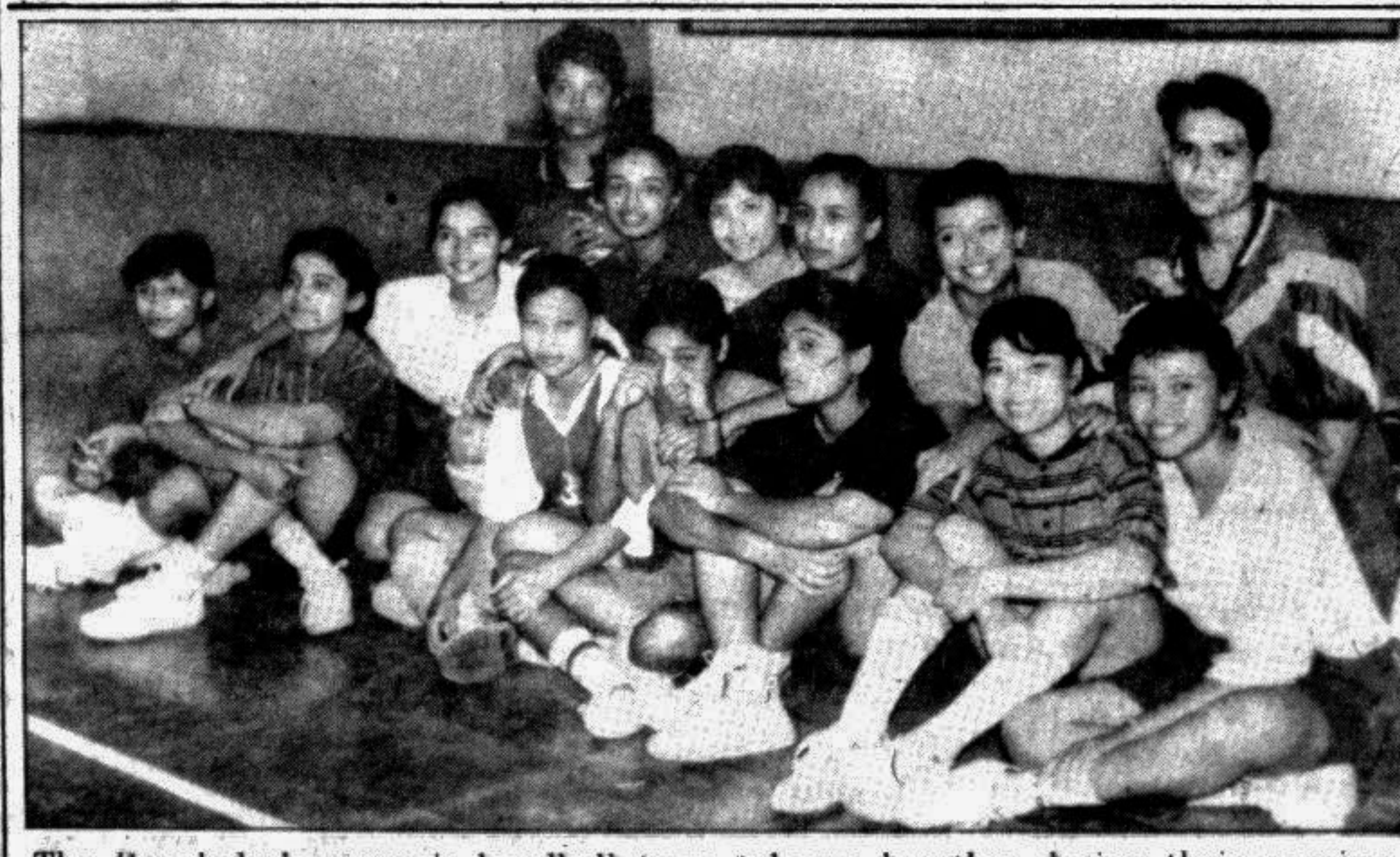
The Bangladesh women's handball team takes a breather during their ongoing preparation for the 6th Commonwealth Youth handball competition which is to commence in Dhaka on August 24.

Oman in the first round of the qualifying matches. They are scheduled to play away in Pakistan on October 11, in Oman on October 18. Their home matches are to be held on October 22nd (Pakistan) and October 29th (Oman).