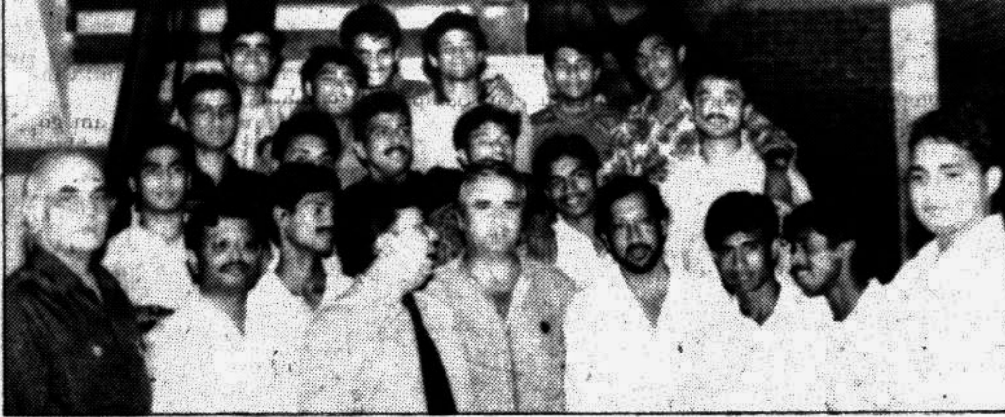
The 19-member Indian Olympic (under-23) football team who are in Dhaka to play two exhibition matches, pose for photographers at the Zia International Airport upon their arrival yesterday afternoon.

MILAN, Aug 19: Retiring Dutch striker Marco Van Basten received an emotional, standing ovation from a crowd of 63,000 Friday night as he paraded the San Siro field to say goodbye for the last time to AC Milan fans, reports AP.