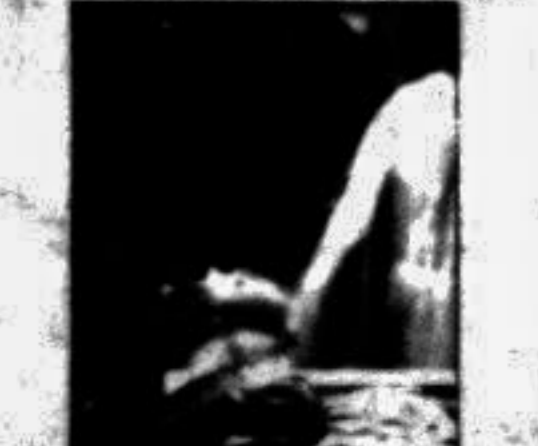
Dreams Woven on Kanthas Page 3