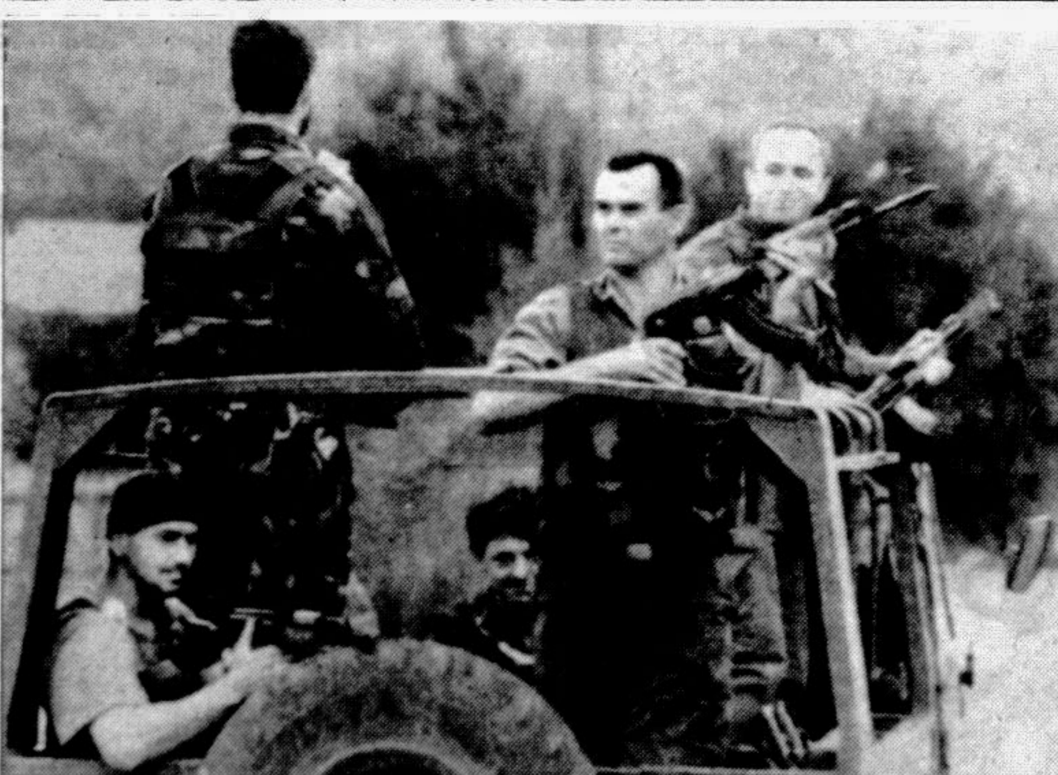
Bosnian Croat soldiers in a jeep heading to the front close to Serb-held western Bosnian town of Drvar yesterday. Croatian troops have injected more manpower to the area as they push forward attacking the Bosnian Serb troops.